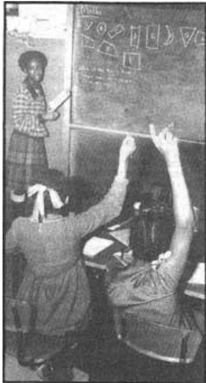
Black Saturday School circa 1970