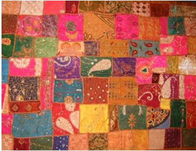
Indian bridal tapestry quilt - Tamil Nadu