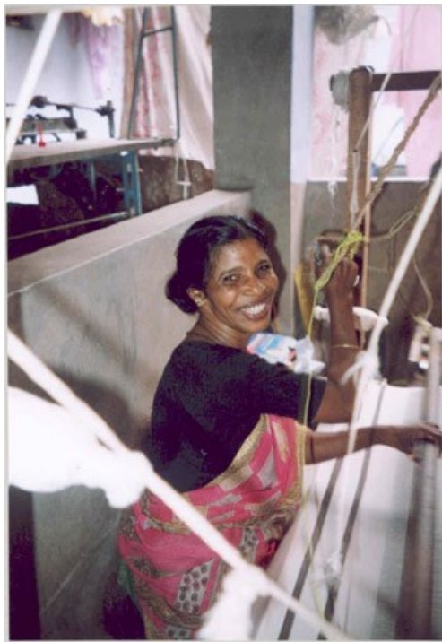
Woman weaver in Southern India at her loom September 2004