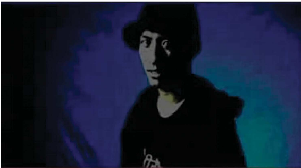
Figure 3. Still shot from the music video 'Flow Ko.'

For Kyd, layering in digital video functioned not as an additive form of meaning-making (Hull & Nelson, 2005; Jewitt, 2002); rather, Kyd layered modes to deftly navigate his diverse social and cultural connections (see Figure 3). This dialogic discourse practice functioned as a pliable art form for Kyd to artistically remake ideas, thoughts,