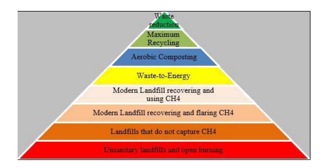
The sustainable waste management pyramid. Adapted from Rodriguez, M.E.D. (2011). Cost-Benefit analysis of Waste to Energy plant for Montevideo; and Waste to Energy in small islands. Available at: <u>http://www.seas.columbia.edu/earth/wtert/sofos/Rodriguez_thesis.pdf</u>

This can include melting down scrap aluminium for processing, palletisation of plastic wastes for reuse, and pulping cardboard/paper wastes to produce other paper/card products. This has been done in larger settlements in Indonesia, where private sector waste management is common, as well as in areas of Malaysia such as Kota Kinabalu and Kajang. [3] [8]