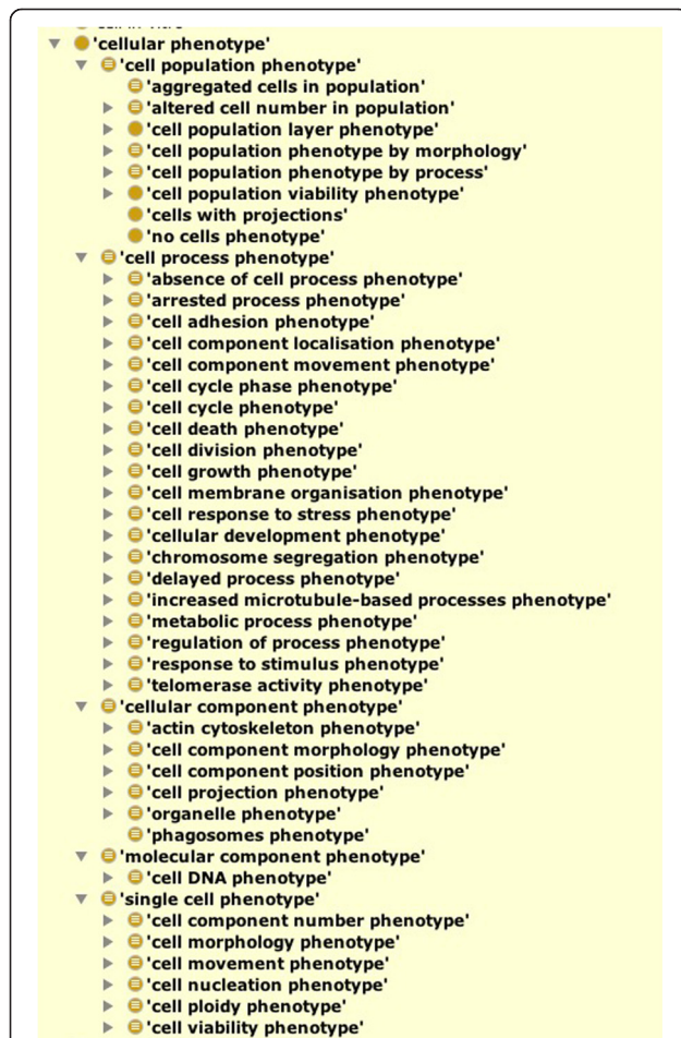
Fig. 1 Visualisation of the top-level terms in the CMPO phenotype ontology showing cell process, single cell, cellular component and molecular component phenotypes

As of release 1.9 CMPO contains 361 phenotype terms. CMPO provides a root class called 'cellular phenotype' which is further divided into five major sub-types, namely; 'cell process phenotype' , 'cellular component phenotype' , 'molecular component phenotype' , 'single cell phenotype' and 'cell population phenotype' . (Fig. 1). Each of these categories represents a different level of granularity for which we see phenotype descriptions in the