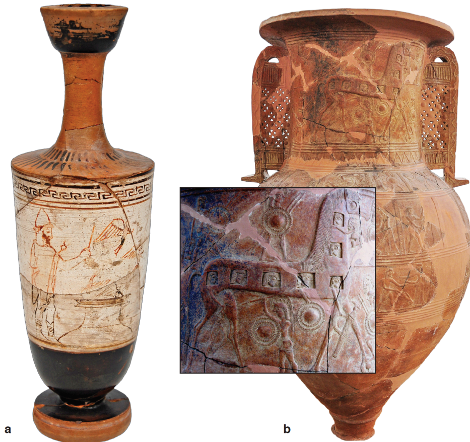
Figure 1. (a) a white-ground oil flask from Attica, Greece showing Hermes Psychopompos ('conveyor of souls') conjuring winged creatures out of, and possibly back into, a half-buried storage jar (~470 BC, height 0.19m; Friedrich-Schiller-Universität Jena Sammlung Antiker Kleinkunst V225); (b) a decorated burial pithos from the Greek island of Mykonos with the earliest known depiction of another famous mythic container, the Trojan horse (~670 BC, height 1.5m; Mykonos Archaeological Museum 2240)).

In any case, my goal in introducing the above Archaic-Classical Greek details has been to highlight how this particular container form might have become fairly central to the way a Mediterranean society thought about moral good and evil, resource concentration and dispersal, the living and the ancestors, the changing of the seasons, or food scarcity and abundance. More prosaically, large clay storage jars or pithoi (other ancient or modern terms such as dolia , karasi , kvevri , talha or tinaja could be used too, although they are often more narrowly connected to wine-making) were a technological solution to the problem of dry and liquid storage, and were particularly relevant in the Mediterranean due to the demands of the wine and olive oil industries. What I will seek to make clear in the brief comment that follows is that such a solution was far from the only one available, that its technology spread across the Mediterranean and through time in structured, interesting ways, and that its widespread adoption also opened the lid on a host of longer-term cultural consequences.