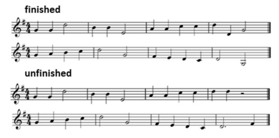
Fig. 1. Examples of stimuli used in the music experimental battery: 'finished' (tonally resolved) and 'unfinished' (tonally unresolved) melodies presented in the tonal (harmonic) expectancy test (see text for further details).

Abbreviated Scale of Intelligence (WASI) Matrices score, an index of overall disease severity] within the patient cohort.