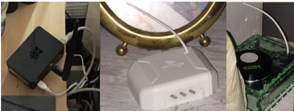
Figure 1. Hub (left), temperature/humidity sensor (middle) CO 2 sensor (right) deployed in situ.