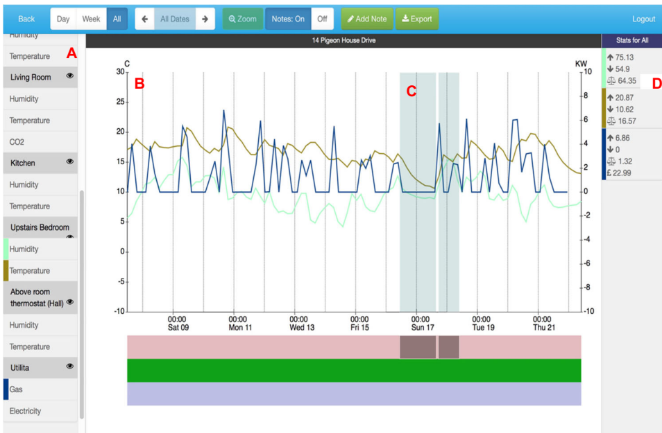
Figure 2. The interactive web app enables (a) filtering (show/hide) of sensor data sources, (b) pan and zoom time series line charts, (c) annotations (highlights) viewable on click, and (d) stats for selected sources (min/max, average, cost in £).

The CharIoT system was deployed in 10 UK homes in the Bristol area for three to four weeks over the winter months of 2015/16 after approval from our University's ethics committee. The deployment furnishes us with a field site to study the situated, collaborative accomplishment of data work. This section briefly describes the advisors' role, the participants in our study, the structure of the deployments, and data collection and analysis.