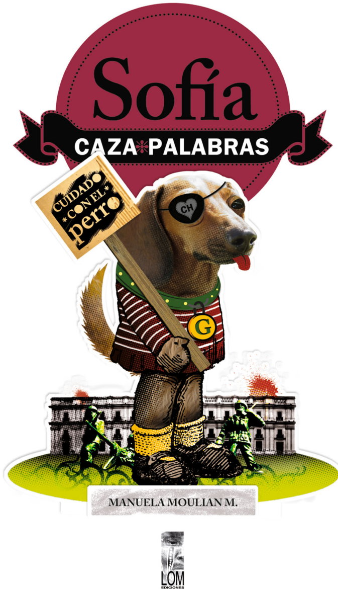
Fig. 2 Cover of Sofía caza palabras

Sofía caza palabras is a graphic novel about eight-year-old Sofia, who grows up under the dictatorship. She writes her secret notebook while trying to make sense of the mysteries that surround her life. The plot follows her dog Garp, named after John Irving's novel, which Sofia's dad is reading. While Sofia tries to understand the meaning of words used in her family, such as "proletariat" and "historic materialism", the dog brings trouble by its peculiar habit: eating books. Sofía caza