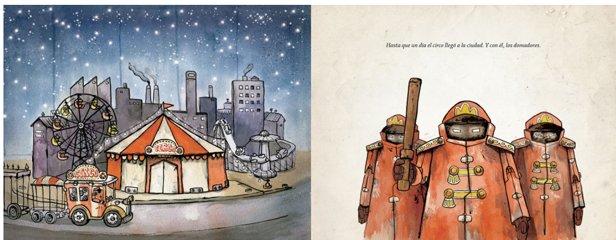
Fig. 1 Illustrations from Historia de un oso . My translation of the text reads: 'Until one day the circus came to town. And with it, the tamers'

Historically, literature has been a place to express utopian visions and subtle criticism of the existing social order. Literature for children has also been used as an effective tool for the dissemination of official ideologies, influencing behaviour and beliefs (Nilsen and Bosmajian, 1996, p. 308; Dorfman, 2009, p. 173). Because the author's own ideology plays a key role when writing for young readers, children's books can also be seen as political acts (Hollindale, 1992, p. 40). Naomi Sokoloff (2005) argues that children's literature "is often less revealing of kids than of ways