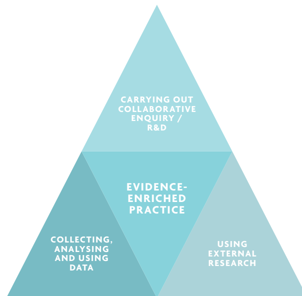
FIGURE 1: THREE INTERCONNECTED STRATEGIES FOR EVIDENCE-ENRICHED PRACTICE

I assume (or at least hope) that most readers are interested in evidence-informed (or evidence-enriched) practice, if not passionate about its merits. But you will no doubt know colleagues who are not similarly predisposed, including some who are downright sceptical or resistant. Persuading yourself to