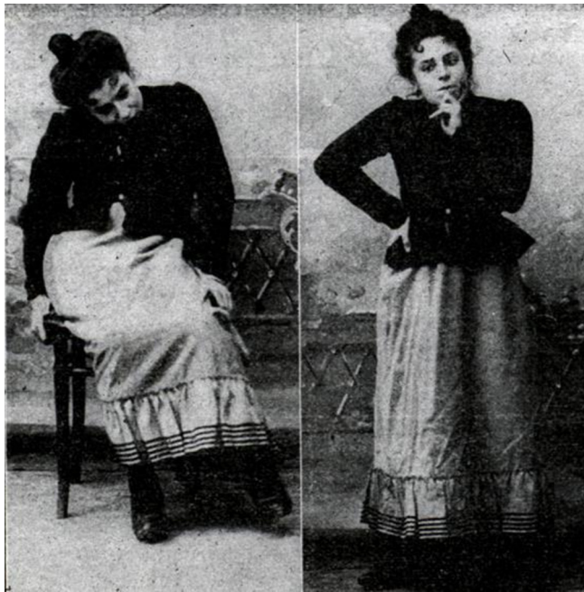
Figure 1 A classical picture of sensory trick ( geste antagoniste ) in spasmodic torticollis. 5 Left : without trick. Right : abnormal posture is corrected by placing the right hand on the hip bone and touching the chin with the left hand.

Detailed immunohistochemical studies have suggested that the striatal projection neurons (medium spiny neurons (MSNs)) affected in the early dystonic phase of the disease likely are located in striosomes, a neurochemically defined compartment in the striatum, as opposed to the striatal matrix, for which a marker (calbindin) remained (figure 2). No recognisable abnormalities were observed in the cerebellum in these cases.