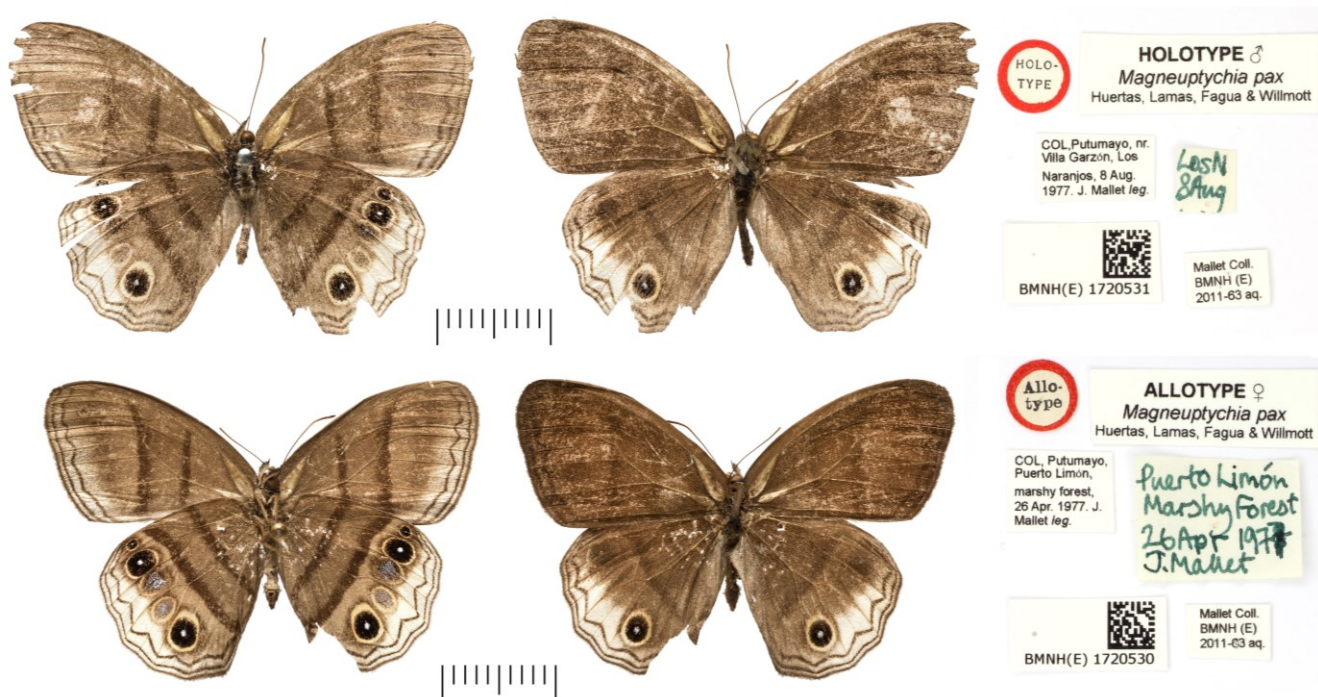
Figure 1. Magneuptychia pax n. sp. A. (above) Male holotype dorsal view (left) and ventral view (right). B. (below) Female allotype dorsal view (left) and ventral view (right).

this species differs in having two dots, instead of one pale dot, in the VHW ocelli. The ocelli are similar in this respect to those of Magneuptychia gera (Hewitson, 1850), but while the latter species and its likely relatives often have white shading in ventral marginal areas, as in M. pax , they also have an extra ocellus in VHW cell 2A-Cu2, which is lacking in M. pax . Preliminary molecular analyses (M. Espeland et al. , in prep.) support the diagnosis of this new species as being highly distinct from other Euptychiina.