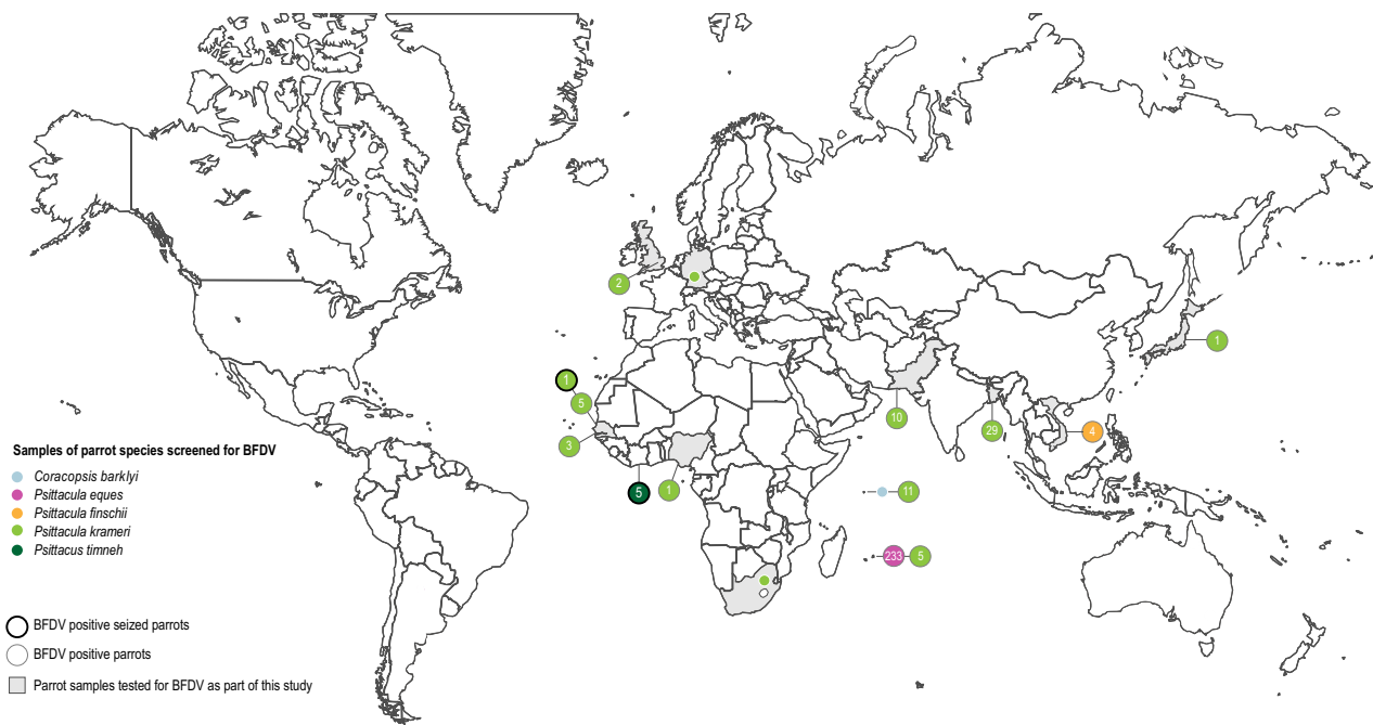
Figure 1. Sampling locations of parrot species screened for Beak and feather disease virus (BFDV) and the number of BFDV positive individuals in each study location.

contamination between samples from different regions. For blood, approximately 50–100 \mu\text{L} of whole blood was used from each sample and digested in 250 \mu\text{L} of DIGSOL lysis buffer with 10 \mu\text{L} of 10 mg/mL proteinase K. For skin and muscle tissue, approximately 4 mm 2 of tissue was used from each sample and digested in 250 \mu\text{L} of DIGSOL lysis buffer with 20 \mu\text{L} of 10 mg/mL proteinase K. For feather extractions, feather barbs were removed and the calamus was chopped finely prior to digestion in 250 \mu\text{L} of DIGSOL lysis buffer with 40 \mu\text{L} of 10 mg/mL proteinase K and 70 \mu\text{L} of 1M dithiothreitol. Extractions were quantified using a Qubit dsDNA Assay Kit (Thermo Fisher Scientific, Waltham, MA) and standardized to approximately 25 ng/ \mu\text{L} prior to BFDV screening where possible because of high yields. The only exception to this protocol was one of the U.K. Rose-ringed Parakeet samples, from which DNA was extracted prior to its being sent to DICE for analysis.