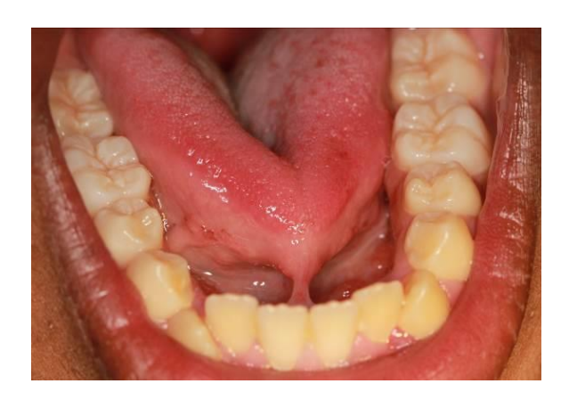
Figure 3. A tongue-tie.

Role of the GDP: The GDP can diagnose tongue ties and reassure parents of the diagnosis. If there are feeding concerns with infants an onward referral is indicated.