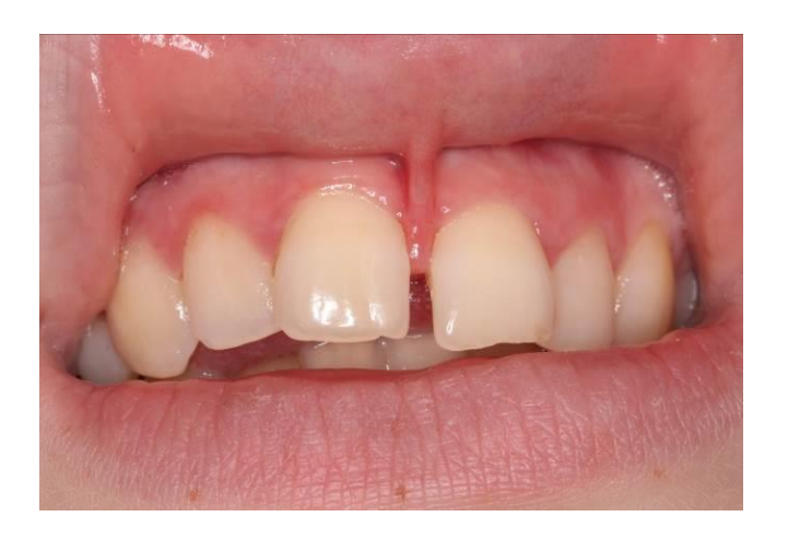
Figure 2. A low lying labial frenum.