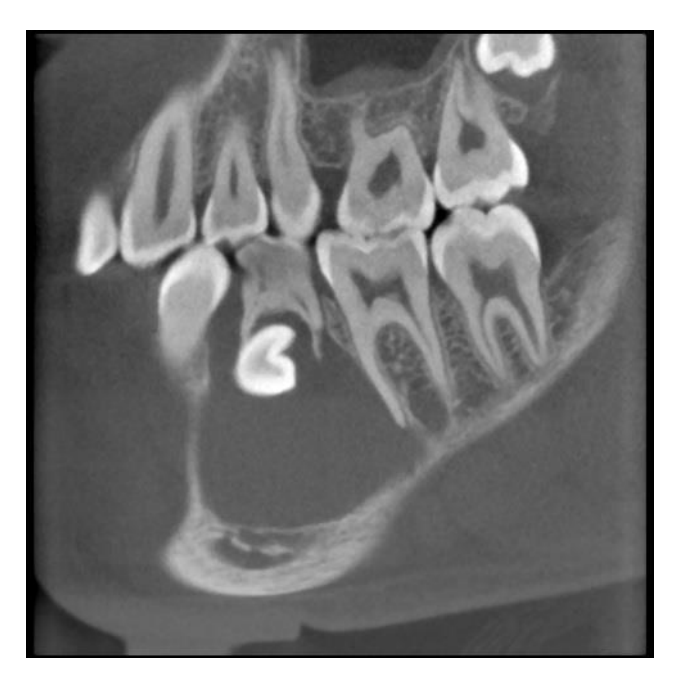
Figure 4. A sagittal section of a CBCT image showing a dentigerous cyst associated with the lower right second premolar.

Role of the GDP: The GDP may be the first clinician to suspect a dentigerous cyst following a clinical and radiographic examination. If a cyst is suspected the patient should be referred to secondary care for a further assessment and for management of the cyst.