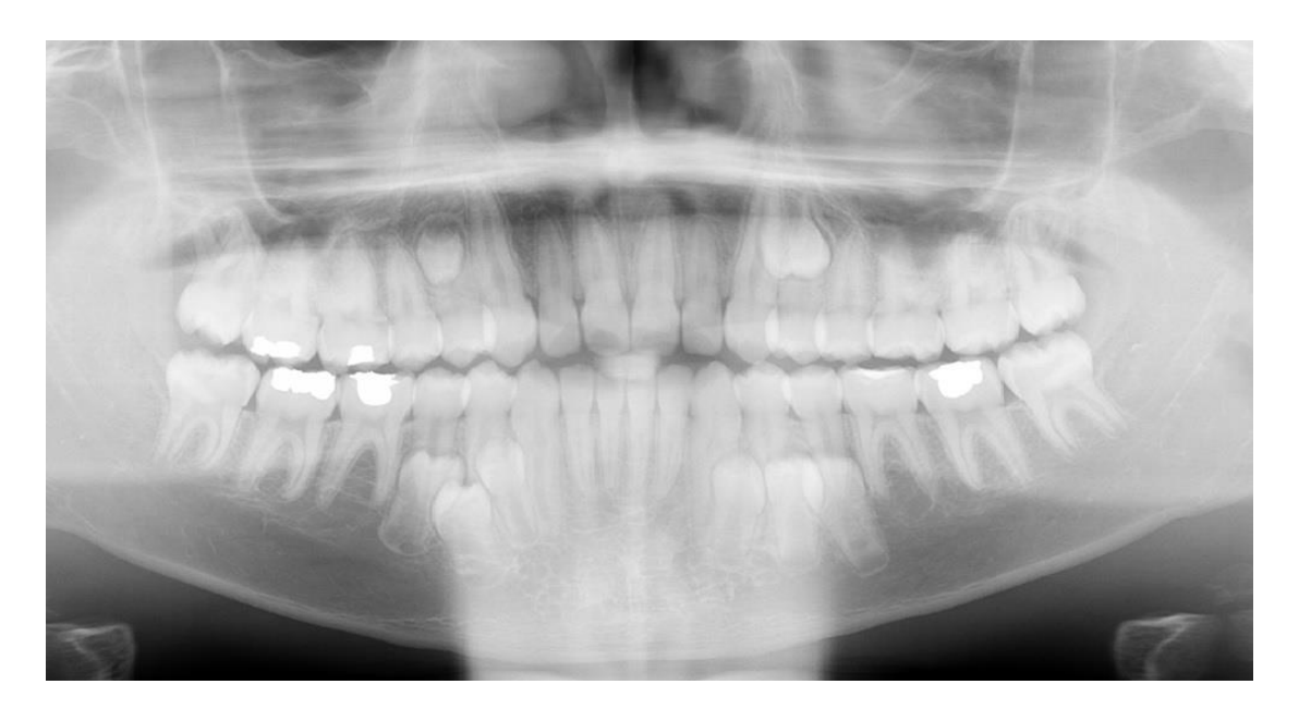
Figure 5. A DPT showing the presence of supplemental premolars in all quadrants.