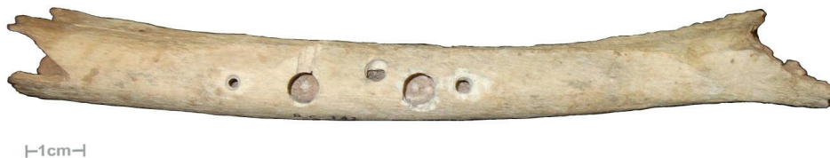
Figure 1: Incomplete femur of a human, Homo sapiens Linnaeus, 1758, from Bob's Cave, Kitley Estate (PCMAG:KBC162). Five large holes were drilled into the specimen for accelerated mass spectrometry (AMS) in the 1990s. Analysis dated this bone to approximately 5,035 years before present (Chamberlain, 1996).

Along with a lack of accessible, clear, published guidelines for museum professionals, there are other reasons why there may be apprehension about destructive sampling. A museum's main role is to preserve collections, not destroy them. It can sometimes be difficult for the museum professional to know how to assess requests for destructive sampling as it may not be clear exactly what the researcher is requesting or why. Often, research requests are written using detailed, highly specialist language, which can make them difficult for museum professionals with expertise in different areas to understand, let alone evaluate. Furthermore, for very rare or precious specimens, curators may receive requests from multiple research groups with similar objectives. At this point, it can be exceedingly difficult to select a proposal based on merit. Finally, requests may be treated with caution, especially if the museum holds specimens that have undergone previous sampling that has resulted in damage that may appear extreme by today's standards (Figures 1 and 2).