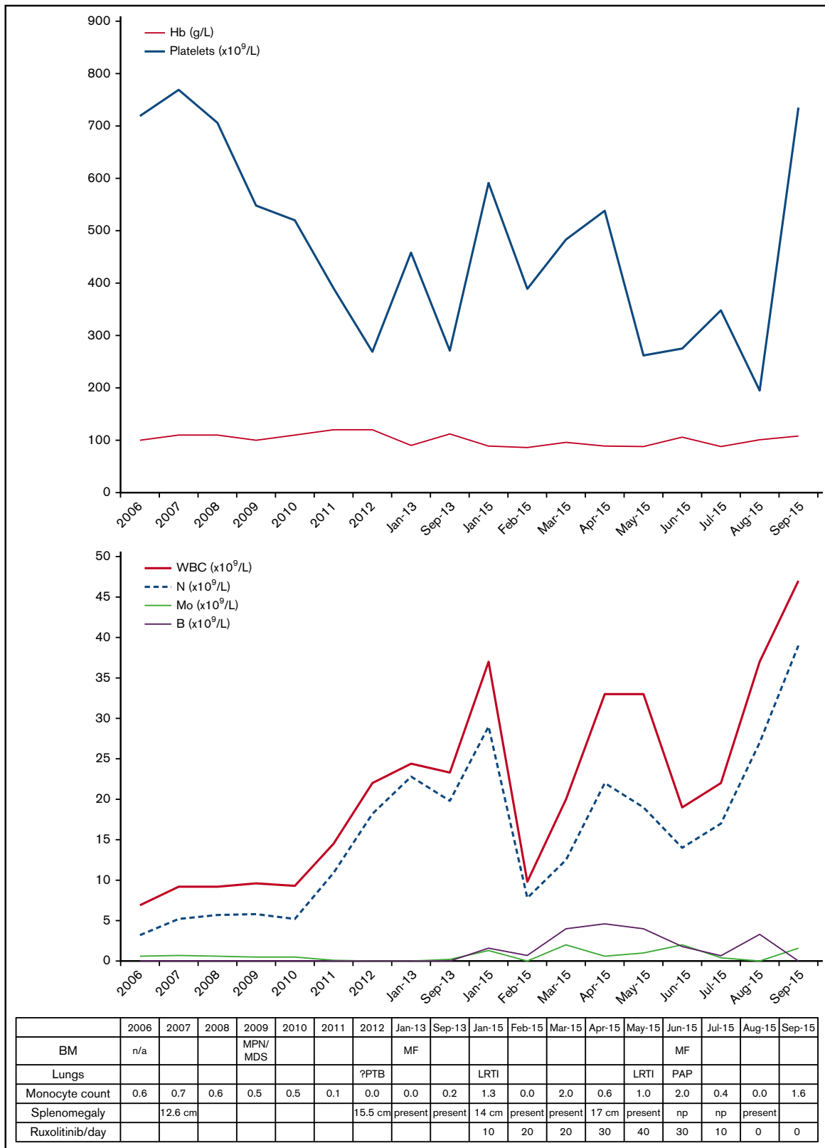
Figure 1. Blood and BM investigations and clinical course (2006-2015). Progress of hemoglobin (Hb) and platelet count (top). Progress of white blood cell count (WBC), neutrophils (N), monocytes (Mo), and blasts (B) in the blood (middle). Table listing diagnostic details, absolute monocyte counts, and clinical events (bottom). LRTI, lower respiratory tract infection; MF, myelofibrosis.