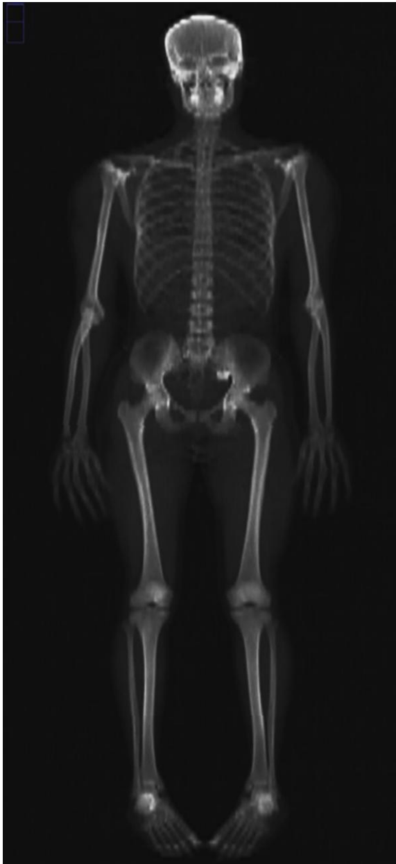
Figure 1: Example whole body DXA image used in this study