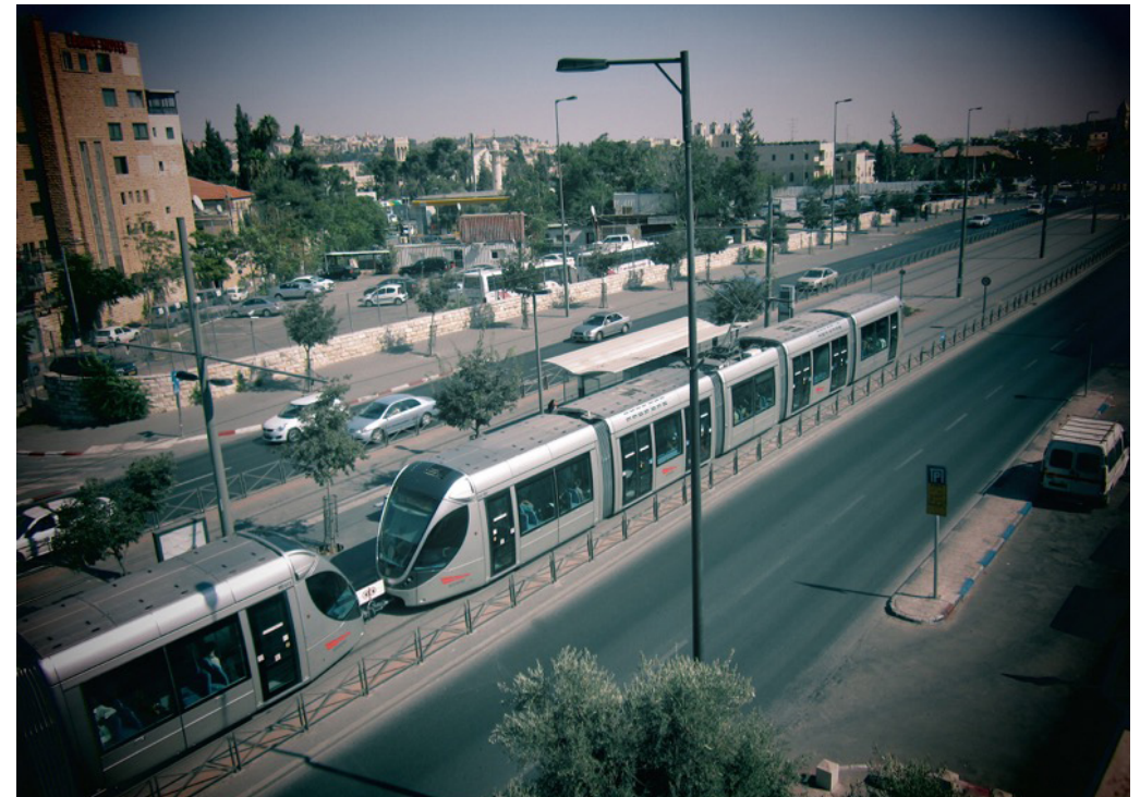
Figure 1: The Jerusalem Light Rail on its route along the Green Line, 2014.

In addition to projecting an image of harmonious shared space, Palestinian usage of the light rail was also aimed at protecting the infrastructure and the Jewish passengers on it, as the former CEO of the light rail operator noted (Interview with Former CEO, CityPass). Here we see how security thinking and normalization are intertwined: rather than exclude dangerous elements, as disciplinary power does, normalization in a security-based system integrates dangerous elements in order