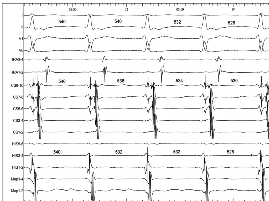
Figure 1 A 4-wire electrophysiology study demonstrating a short RP narrow complex tachycardia. Oscillations of the His bundle potential on HIS 3–4 precede changes of the atrial electrogram on CS 9–10. CS = coronary sinus; HIS = recording of His bundle potential; HRA = high right atrium; Map 1–2 = positioned at right ventricular apex.

Figure 3B shows VOP from the RVA at 530 ms, 20 ms shorter than the TCL. A V-A-H-V response to VOP was demonstrated, ruling out AT. Surface ECG showed no evidence of fusion, as the QRS morphology was identical to that of a paced beat. The stimulus-atrial time compared to the ventriculoatrial time was 135 ms. This would not be in favor of a concealed septal AV accessory pathway. 2 A His