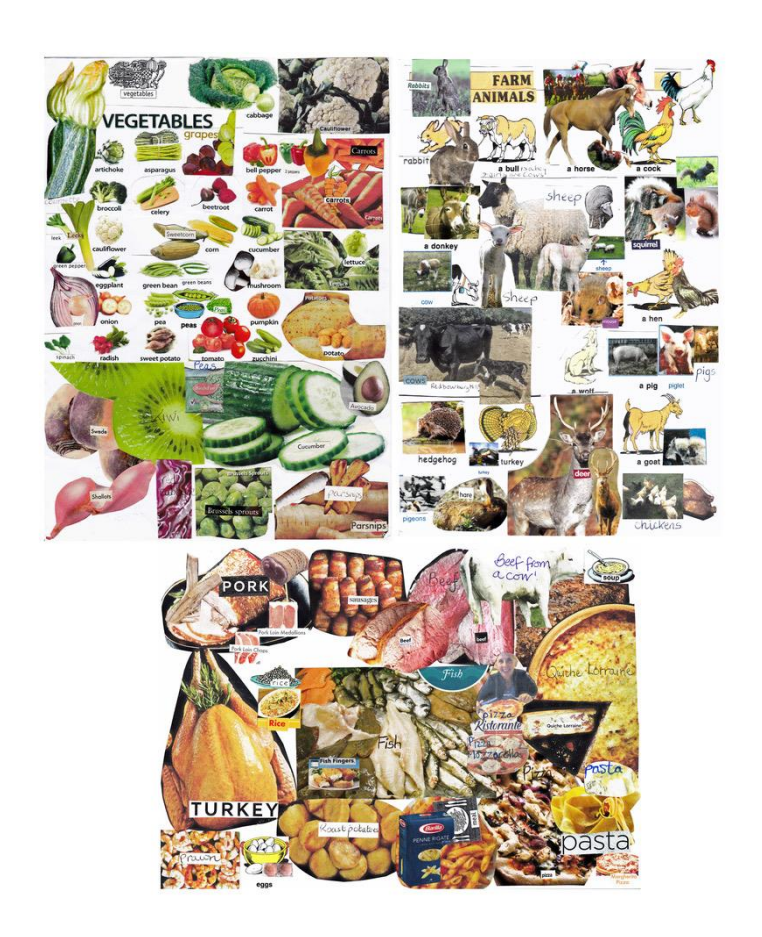
Figure 1. A selection of the patient's aide-memoires. She constructed dozens of sheets with pictures of items with their names associated, arranged by category.