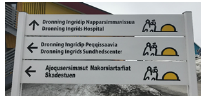
Figure 7: Hospital sign

The sun also appears in a recent sign for Queen Ingrid's Hospital in central Nuuk (Figure 7). In this case the imagery seen on the flag has been modified by a change in colour: the rising/setting sun is yellow rather than red. This alteration could perhaps be interpreted as a subtle shift away from Danish linguistic dominance in Greenland (by removing the link with the colours of the Danish flag). The order of languages reflects this change and the current policies of bringing Greenlandic to the centre: Greenlandic is preceded by Danish in the civic frame.