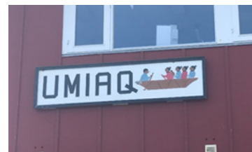
Figure 13: Kindergarten

as obedient, well-behaved, and united, standing together. The image in Figure 2 discussed above also contains a group of Greenlanders shows Greenlanders standing together inside the sun symbol. A similar image of unity is shown in the kindergarten / nursery sign in Figure 13, which contains a group of people rowing together inside an umiaq , a Greenlandic open skin boat that is propelled by oars or paddles. The use of the Greenlandic word umiaq as the name of this kindergarten is in keeping with the fact that the language of primary education is Greenlandic, i.e. the school space is predominantly Greenlandic. By contrast, secondary education in Greenland is conducted in Danish. (Examination of these points is beyond the scope of the present article; see Valijärvi and Kahn, in progress , for discussion.)