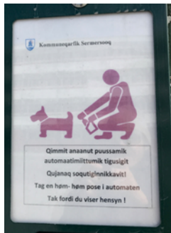
Figure 15: Clean up after your dog

While the majority of signs including people feature groups rather than individuals, on occasion a sign containing a single person can be found. An example of this is shown in Figure 15. In this case, the individual in question is doing the decent urban thing by clearing up after their dog. These traits of obedience and good behaviour are closely linked to those of unity and togetherness that can be seen in the images of groups. The languages of this sign are Greenlandic first and Danish second, as is typical of community and official signs in Nuuk.