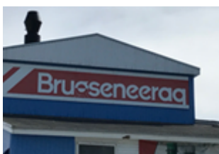
Figure 6: Figure 5: Supermarket Brugseneeraq

The local marketplace likewise makes use of the sun symbol and Greenlandic flag, but exhibits greater use of the Greenlandic language than the zones discussed previously. In Figure 6, the sun is used to make the Danish supermarket Brugsens's name more Greenlandic: it appears inside the g , forming a shape closely resembling the red and white flag design. The name is further localised by the use of the Greenlandic diminutive suffix -eeraq . A larger Brugsens in Greenland does not have the diminutive suffix but ends in an -i instead (Brugseni) for the same localising reasons (The -i suffix is commonly attached to Danish loanwords when used in Greenlandic). The Danish name has been reclaimed and adapted for a specifically Greenlandic clientele. This modification of a Danish supermarket name reflects the centralising Self Rule policies of the Greenlandic government on one hand, and the dual cultural identity of Greenlandic people on the other hand (cf. Sowa, 2004).