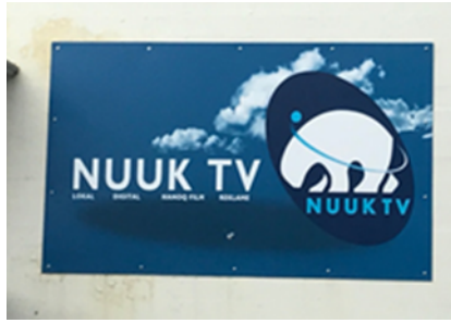
Figure 10: Nuuk television channel

This is also the case with in the bilingual newspaper Sermitsiaq where Greenlandic comes first. It seems that on the sign the Greenlandic language has been replaced by the polar bear. In this respect an instructive comparison can be drawn between Nuuk TV and Air Greenland, as the latter is a dominant player in the portal space in Greenland. Air Greenland likewise draws on national visual associations by use of the red and white colours of the flag, as seen in Figure 11.