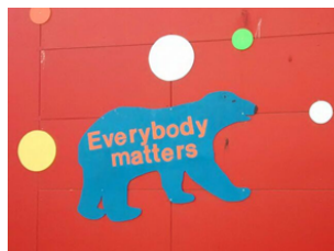
Figure 12: Wall art on social housing

However, in contrast to this Nuuk TV advert, Air Greenland's language policy is trilingual: Greenlandic first, Danish second, and English third. Like the sun symbol, the polar bear is a feature of the façade of social housing in Nuuk. In this case, the polar bear seems to evoke unity, happiness, and global solidarity when featured on the wall of a council house and accompanied by a positive message in English (Figure 12). This piece of wall art is newer than the one in Figure 2 and thus the language of upbeat propaganda is not Greenlandic but English. This use of the polar bear in conjunction with the English text serves to juxtapose this salient symbol of Greenlandic identity with an outward-facing, global orientation, sending the message that the local is fully engaged with the international English-speaking world.