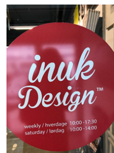
Figure 4: Design shop sign

Perhaps unsurprisingly, the same red sun is also a prominent feature of the realm of consumerism and tourism in Nuuk. For example, it appears in a tourist shop sign accompanied by English and Danish only in white writing (Figure 4). The Greenlandic word inuk ‘person’ is used to evoke authenticity and appeal to tourists (cf. Pietikäinen, 2013). This time the sun, and the clear resemblance to the red and white design of the national flag, invite viewers to consume in the marketplace space, and offer them a shopping experience laden with specifically Greenlandic symbolism.