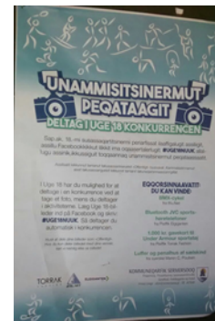
Figure 17: Photo competition

In addition to togetherness and community-mindedness, another common theme seen in the representation of people within the community domain in Nuuk signs is activeness, healthiness, and trendy modernity. For example, the notice in Figure 17 advertising a photo competition aimed at young people features figures engaged in healthy outdoor pursuits and other sports activities. Like most signs in the public domain, the first language in the poster is Greenlandic and the second language is Danish.