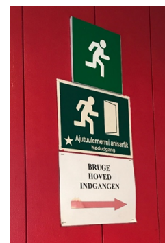
Figure 21: Emergency exit

While the images of people seen in the Nuuk semiotic landscape are often local, as discussed above, global images can be found as well. Such global imagery can be seen in the Nuuk airport, where the internationally recognised figure appearing on an exit sign has first been paired up with Greenlandic text (Figure 21). In this case, the figure is universal, but the sign has nevertheless been localised by means of the Greenlandic and Danish text. As is the norm for official and government signs in Nuuk, the Greenlandic appears first and the Danish second. In this case, the Greenlandic version is also much bigger than the Danish one, indicating that the designers' plan for the portal consists of a fusion of global imagery with Greenlandic language. In this case, as in most of the others discussed above, the Greenlandic language is very firmly at the centre.