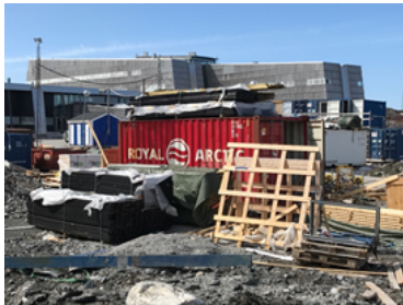
Figure 5: Royal Arctic shipping logo and shipping container

the life of the nation is reflected in the choice of the logo, the sun symbol. It also indicates where the goods are headed or where they are coming from. The use of English reflects the international orientation of the shipping company and the fact that English is the language of the global marketplace.