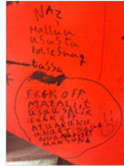
Figure 3: Graffiti inside social housing block

This image is in stark contrast with the colonial reasons behind the existence of the social housing block, as discussed in the introduction above. It can also be instructively contrasted with the transgressive graffiti inside the building (Figure 3), which coincidentally also features a circle on a red background. In this case, the meaning of what appears to be the sun symbol (whether intended as such or not by the artist) has been subverted so that instead of conveying unity, positivity, and national identity, it suggests dissatisfaction and youth identity