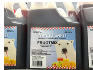
Figure 9: Nanoq fruit concentrate

A striking use of the polar bear is in the supermarket context. Almost all products in Nuuk supermarkets have labels in Danish only, or Danish and other Scandinavian languages, with very few products including Greenlandic. The polar bear is featured on one of the only exceptions to this trend, a fruit cordial aimed at an exclusively at local market with a bilingual Greenlandic-Danish label (Figure 9). The Arctic image is at odds with the fruity flavour of the drink. Yet in the marketplace domain the image serves a means to commodify and sell to Greenlandic consumers, highlighting the centrality of the product in the local context. The rest of the products in supermarkets have Danish labels (possibly for practical reasons as they are imported from Denmark, which has a much larger consumer base).