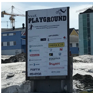
Figure 19: Nuuk Playground shopping centre

An extremely salient example of this emphasis on physical activity as a key element of the community domain in Nuuk is the announcement of a shopping complex currently under construction in the city centre (on the the plot of the notorious block P, a large council house building where significant numbers of rural Greenlanders were settled by the Danish government in the 1960s). The shopping centre will have an English name, Playground (Figure 19). As in leisure posters like that shown in Figure 17, the images accompanying the names of the shops to be featured in the shopping complex are basketball players and BMX cyclists. As in the case of the posters shown in Figures 17 and 18, these images reflect the message that urban people in Nuuk are physically active and in control, whether it be in Greenlandic or English.