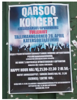
Figure 18: Concert

An extremely salient example of this emphasis on physical activity as a key element of the community domain in Nuuk is the announcement of a shopping complex currently under construction in the city centre (on the the plot of the notorious block P, a large council house building where significant numbers of rural Greenlanders were settled by the Danish government in the 1960s). The shopping centre will have an English name, Playground (Figure 19). As in leisure posters like that shown in Figure 17, the images accompanying the names of the shops to be featured in the shopping complex are basketball players and BMX cyclists. As in the case of the posters shown in Figures 17 and 18, these images reflect the message that urban people in Nuuk are physically active and in control, whether it be in Greenlandic or English.