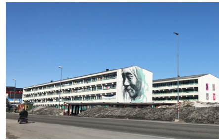
Figure 20: Social housing

As seen above in the cases of the sun and polar bear in Figures 2 and 12 respectively, social housing in central Nuuk has often been reclaimed and rebranded with street art containing images strongly associated with Greenlandic identity and culture. A striking example of this trend is shown in Figure 20, which contains an image of a smiling Greenlandic man on the wall of otherwise anonymous tower blocks in central Nuuk. This image can be contrasted with most of the other images of people discussed above in that it exhibits a lone figure rather than a group, does not explicitly indicate obedience or community-mindedness, and does not show physical activity. Rather, the man's unmistakably traditional Greenlandic appearance suggests that, instead of classifying this figure as an outlier among the images of people discussed above, this image can more fruitfully be understood as a symbol of Greenlandicness just like the sun and the polar bear.