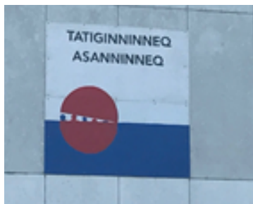
Figure 2: The wall of a social housing block

This image is a prominent feature of the semiotic landscape of Nuuk, appearing on numerous signs in a variety of different contexts. For example, on the wall of a social housing block in Nuuk we can see an image of the sun accompanied by the words tatiginnineq ‘trust’ and asannineq ‘love’ (Figure 2). It is important to note that the sun symbol in this case draws explicitly on the imagery of the Greenlandic national flag, as it is framed by a blue ocean underneath and a white sky above. The imagery appears to be used to convey unity: people (tenants of the building and, in the broader sense, citizens of Greenland) are in on this together (see ‘People’ section below for further discussion of the theme of unity in Nuuk signs).