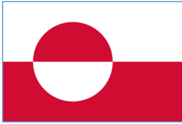
Figure 1: Greenlandic flag

This image is a prominent feature of the semiotic landscape of Nuuk, appearing on numerous signs in a variety of different contexts. For example, on the wall of a social housing block in Nuuk we can see an image of the sun accompanied by the words tatiginnineq ‘trust’ and asannineq ‘love’ (Figure 2). It is important to note that the sun symbol in this case draws explicitly on the imagery of the Greenlandic national flag, as it is framed by a blue ocean underneath and a white sky above. The imagery appears to be used to convey unity: people (tenants of the building and, in the broader sense, citizens of Greenland) are in on this together (see ‘People’ section below for further discussion of the theme of unity in Nuuk signs).