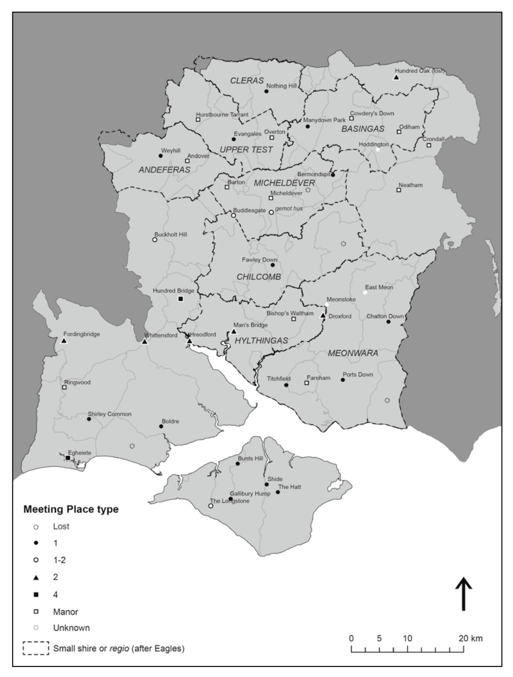
FIGURE 13.2 Small shires and regiones of Hampshire, shown alongside the Domesday hundreds and their meeting-places