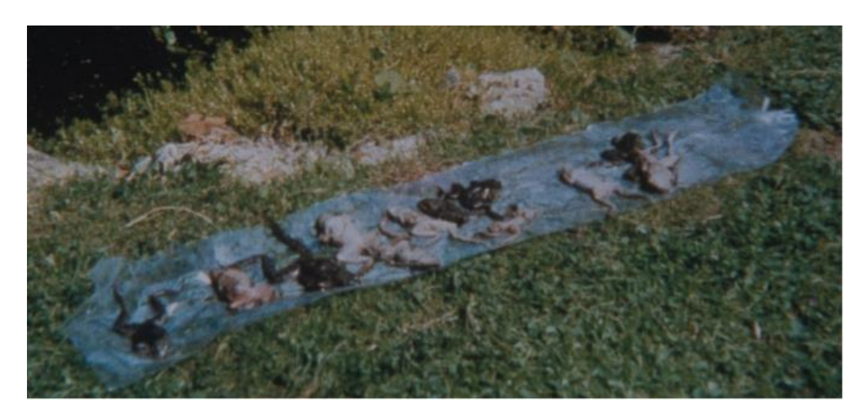
Fig. 1. Mass mortality of common frogs ( Rana temporaria ) in the U.K. due to ranavirus infection. Affected animals in such mass mortality events exhibit systemic haemorrhagic disease (see text).