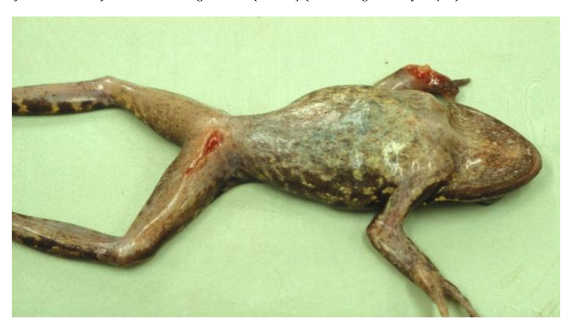
Fig. 2. A dead common frog ( Rana temporaria ) with lesions typical of the skin ulceration form of ranavirosis. Note the long, thin (linear) ulcer on the animal's left ventral thigh and the loss of digits on the right forefoot along with part of that foot.

incursion into the U.K., possibly along with North American bullfrogs, which were imported into the U.K. by the pet trade in the 1980s: this species is known to be a carrier of FV3-like ranaviruses (Cunningham, 2001).