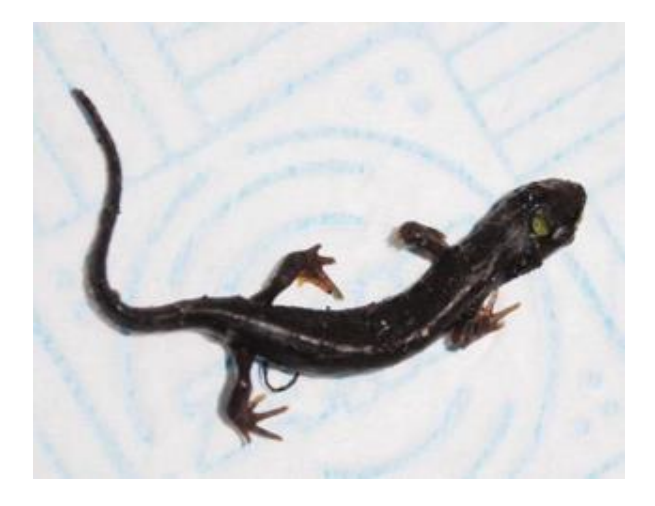
Fig. 4. A captive Bosca's newt ( Lissotriton boscai ) in the U.K. with chytridiomycosis due to Batrachochytrium salamandrivorans infection. Note the emaciated body condition and lack of grossly visible skin lesions.

Despite extensive surveillance, B. salamandrivorans infection has not yet been found in any wild amphibian in the U.K. (author's unpublished observations), but the infection has been found to be widespread in captive collections in Great Britain and elsewhere in Western Europe (Fitzpatrick et al. , 2018; Sabino-Pinto et al. , 2018) (Fig. 4). At least one native British amphibian, the great crested newt ( Triturus cristatus ), is known to be highly susceptible to lethal infection with B. salamandrivorans (Martel et al. , 2014), therefore measures should be taken to prevent the spread of this pathogen into wild amphibian populations.