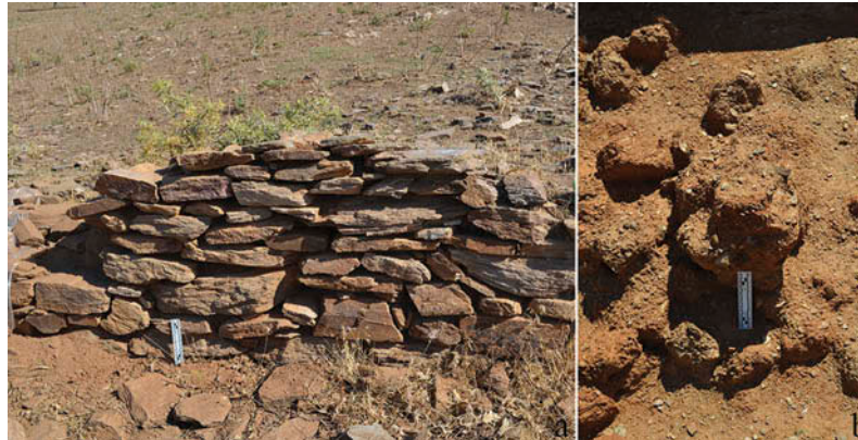
Figure 5. Eski Haciveliler conservation laboratory testing sites: (a) fieldstone masonry wall (south side) surrounding the schoolhouse perimeter and (b) mudbrick wall (west side) from the schoolhouse.

In order to adopt sustainable practices, we investigated a number of recipes based on cement-, lime-, and cement-lime mixtures, given that hydraulic lime is difficult to procure. Tested mortars used locally available soils, collected from Eski Haciveliler (EH1, EH2, and EH3) and Tekelioğlu (T4). Following instruction from local experts, sieving removed aggregate (small pebbles and rock), organic detritus, and other components from selected soils in order to produce a homogenous matrix for use in mortar recipes. Cement-, lime-, and cement-lime-based mortars were tested using different recipes to determine the most appropriate working and drying properties for use in repointing. All mortar recipes were prepared using water from the nearby fountain (çeşme) on site. 2