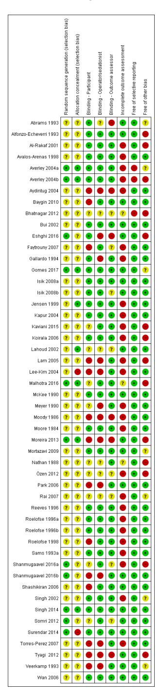
Figure 2. Risk of bias summary: review authors' judgements about each risk of bias item for each included study.