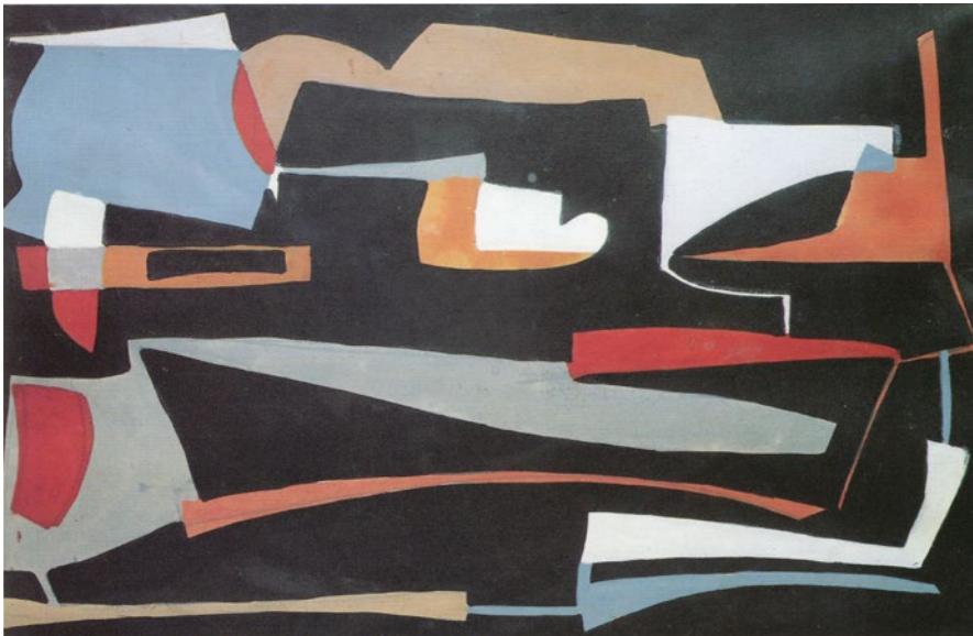
Figure 9 Carla Accardi, Composizione , 1948. Tempera on paper, 30 x 20 cm. Archivio Accardi Sanfilippo, Rome.

After Forma had disbanded, Accardi continued to explore the link between fluctuating and settled definition. Her monochrome works from the 1950s