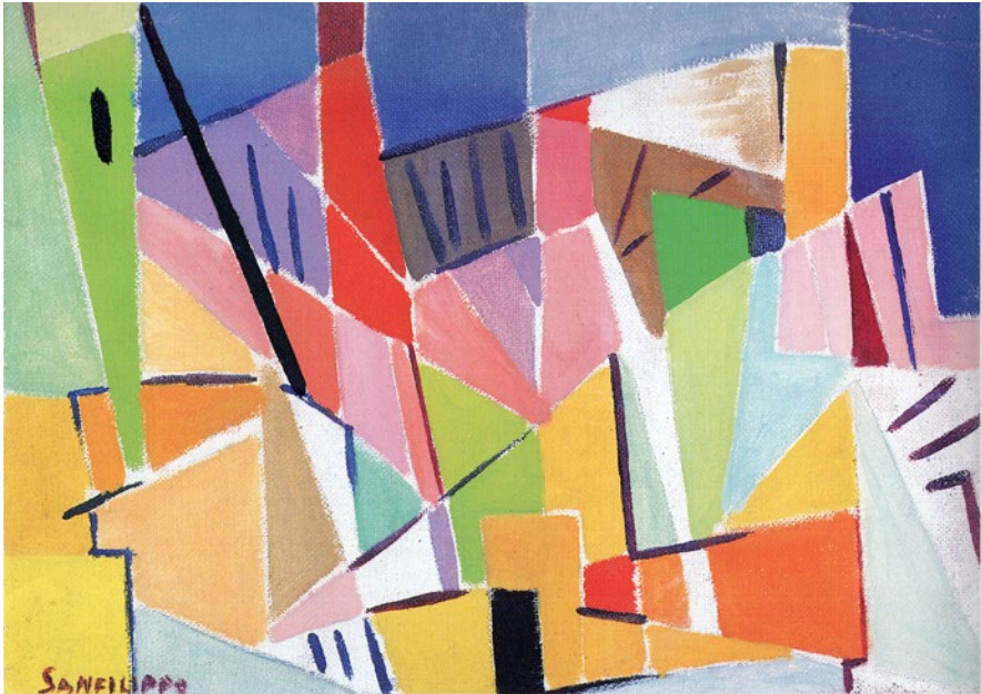
Figure 2 Antonio Sanfilippo, Paesaggio , 1947, 1/47. Oil on canvas, 30 x 40 cm. Archivio Accardi Sanfilippo, Rome.

irreconcilable'. This was a reference to the earlier criticism of the Russian Formalists' systematic theory of literature, which had been made by Marxist theorists on the basis that such a purely formal system ignored the material conditions in which art and literature were produced, and with which they should be in communication. Leon Trotsky's attack on the Formalist School in Literature and Revolution (1924) had concluded: '[t]hey believe that "In the beginning was the Word". But we believe that in the beginning was the deed. The Word followed, as its phonetic shadow'. 10 The Forma manifesto's oblique reference to this earlier divorce acted, then, in the first instance to link Forma's artistic theory with the Russian Formalists and, in turn, was an attempt to rupture with any political fiat on artistic style. For Forma to defy Guttuso's PCI-sponsored realism may have been daring, but to attempt to resurrect the concepts of Russian Formalism in a visual art form as a valid Marxist alternative, ran greater risks including that of being dismissed as disingenuous or just naïve. Through the following exploration of some