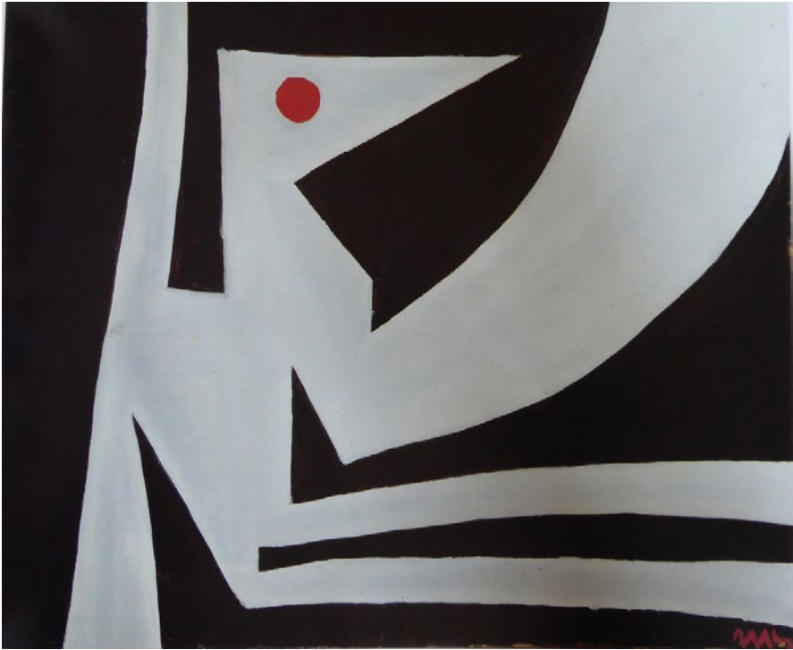
Figure 6 Mino Guerrini, Il Sariga , 1948. Oil, tempera, lentils, salt, car paints on canvas, 50 x 60 cm. Collezione Achille Perilli, Orvieto. © DACS 2018.

Guerrini's work is less ambitious than Boetti's, his earlier use of car paints in what appears to be a latent gesture of resistance, foreshadows Boetti's political play with these same industrial materials.