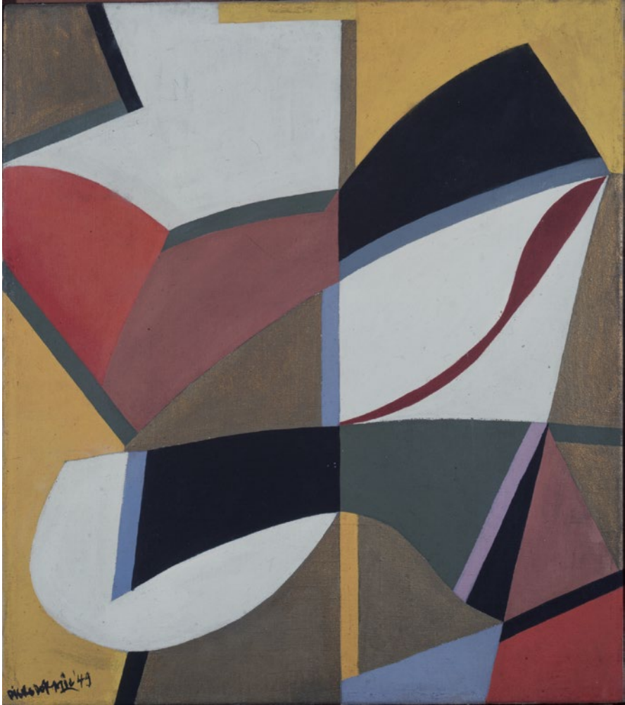
Figure 5 Piero Dorazio, Leda , 1949. Oil on canvas, 62 x 55cm. Archivio Piero Dorazio, Milan. © DACS 2018. Courtesy of Archivio Piero Dorazio.

[a]rt exists that one may recover the sensation of life; it exists to make one feel things, to make the stone stony . The purpose of art is to impart the sensation of things as they are perceived, and not as they are known. The technique of art is to make objects ‘unfamiliar,’ to make forms difficult, to increase the difficulty and length of perception because the process of perception is an aesthetic end in itself and must be prolonged. 19