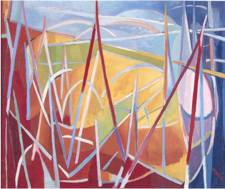
Figure 10 Piero Dorazio Il ponte di Carlo , 1947. Oil on canvas, 55 x 66 cm. Archivio Piero Dorazio, Milan. © DACS 2018. Courtesy of Archivio Piero Dorazio, Milan.

photographs of Forma's works are placed beside advertisements for restaurants and shops. With their small portable measurements included below them, these photos can begin to resemble the neighbouring adverts. The spectre of a more cynical age, where an art object became another consumable thing, may have already been emerging as victor in Gramsci's struggle, coming into view in these pages despite all of Forma's declarations to the contrary.