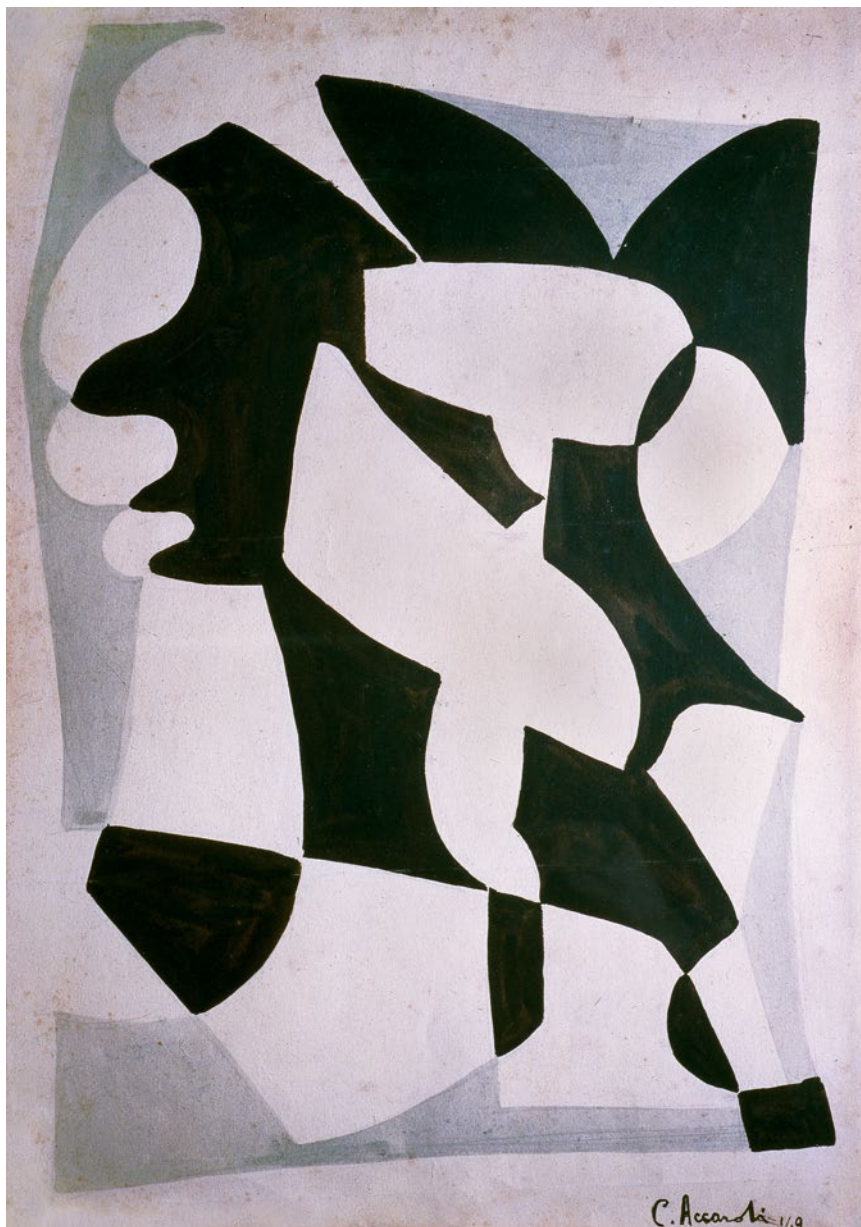
Figure 8 Carla Accardi, Composizione , 1949. Pencil and watercolour on paper, 43 x 30 cm. Archivio Accardi Sanfilippo, Rome.