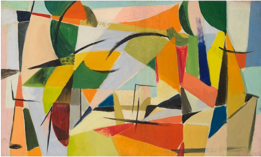
Figure 1 Carla Accardi, Scomposizione , 1947. Oil on canvas, 33 x 55.5 cm. Museo del Novecento, Milan.

rhetoric, although how this should be articulated was proving divisive. The competing demands for artistic autonomy and political commitment formed a tightrope along which many artists were feeling their way, negotiating new artistic freedom while staying loyal to an anti-fascist politics that was often expressed in Marxist terms. Tortured debates were taking place between groups of artists across Italy, which ruminated on the binaries of form and content, and the political implications of each. 3 Several contemporary writers, film-makers and artists, such as Guttuso, held content to be most important, and realism was considered by many to be the only legitimate mode of artistic address in a post-war and post-fascist Italy. This was, in part, because of Marxist demands to bring home the harsh realities of ubiquitous poverty in a legible form, and, in part, also because of the perceived redundancy of Italian modernist art after Futurism's close relationship with fascism during Mussolini's regime, condemned by many as almost symbiotic. Walter Benjamin had written that their entwinement had led to the aestheticisation of politics, and like Benjamin had done, many in Italy were now calling instead for the politicisation of aesthetics. 4