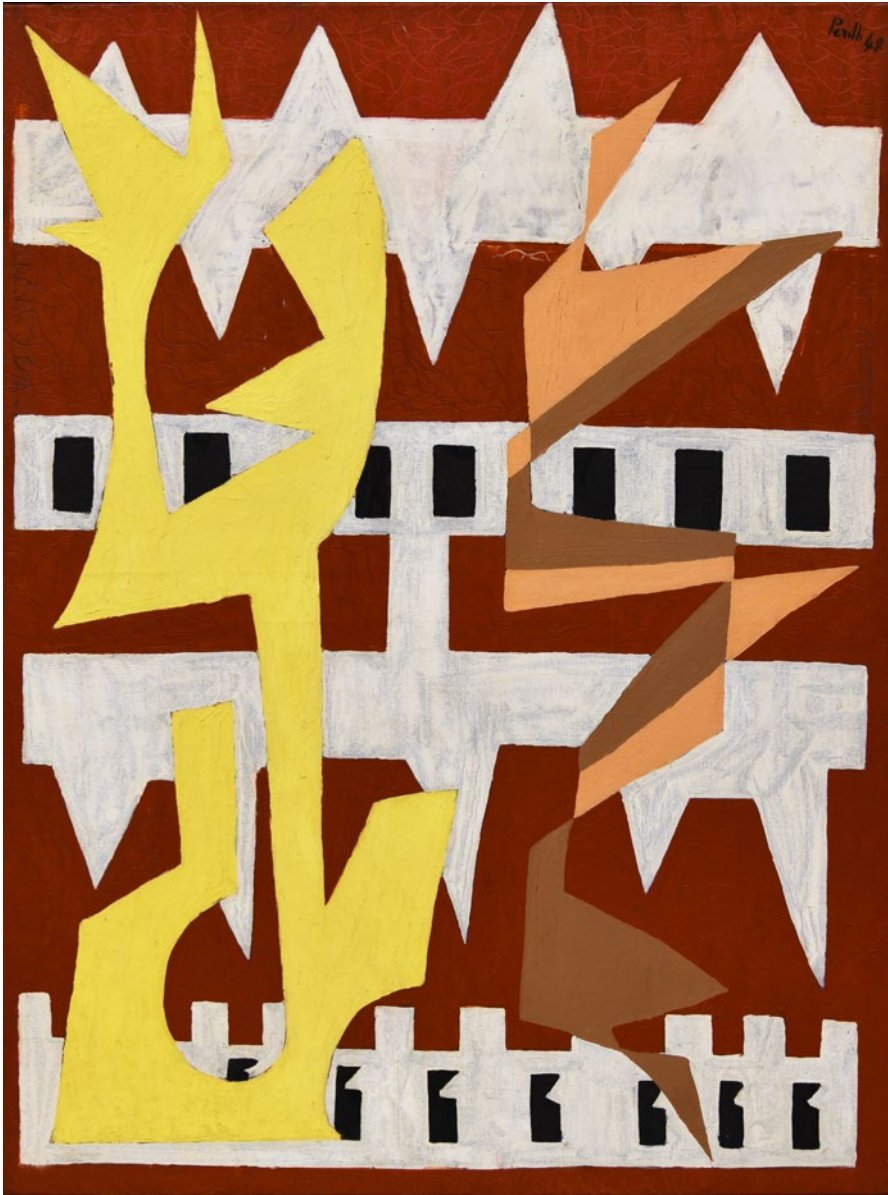
Figure 7 Achille Perilli, Forme in nevrosi , 1948. Oil on canvas, 100 x 70 cm. National Gallery of Modern and Contemporary Art, Rome.