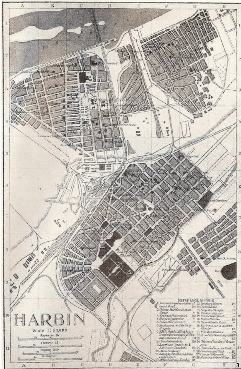
Figure 3 The Russian urban plan for Harbin, a city created at the end of the 19 th century by the construction of the Trans-Siberian Railway, 'one of the greatest arteries of traffic the world has ever seen [and] one of the chief factors in shifting the centre of gravity of the world's trade,' and today boasting a population over 10 million (Colquhoun 1898, 327–328).

considered peripheral and ignored' (Lim 2012, 2). What is important here, as the voice of former others increasingly gets heard, is the need, as Jyoti Hosagrahar emphasises in Indigenous Modernities , 'not merely to celebrate and give voice to minority discourses and knowledges in order to include them in their subordinate positions in existing privileged accounts of modernity, but to question the master narrative' (Hosagrahar 2005, 6).