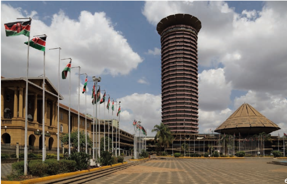
Figure 6 The 105 m-high Kenyatta International Convention Centre in Nairobi (1973), designed by David Mutiso and Karl Henrik Nøstvik, which became a powerful architectural symbol of Kenyan independence in an icon of a burgeoning capital (Source: the author).

radically different’ (Eisenstadt and Schluchter 1998, 4). As Eisenstadt and Schluchter contend, ‘The actual developments did not bear out the assumption of convergence, not even in the West.’ (Eisenstadt and Schluchter 1998, 4) As long as culture is constantly changing, a homogenous human culture is impossible, but it does pose some important questions for cultural heritage and the built environment in the future. As modern cities of the 20 th century are being recognised for their outstanding universal value, what will be the cultural value or contribution to humanity of the 21 st -century city with its tens of millions of residents? Which millennial cities will follow Brasilia, Tel Aviv, Le Havre, Rabat and Asmara onto the World Heritage List and in what ways will such a global list even be relevant in a future of 12 billion human inhabitants?