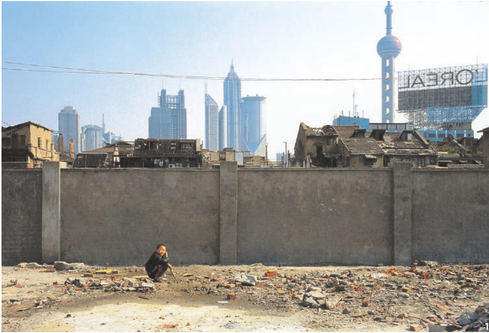
Figure 1 The complex urban landscape of Shanghai, where change has been a constant feature of the city's character; 'Day by day old buildings are disappearing and modern ones rising in their place. It is to be feared that many of the ancient landmarks will soon be gone.' (Gamewell, 1916) (Source: the author).

will soon be gone.' (Gamewell 1916) (Figure 1) As Shanghai, with its 24 million residents, has grown to comprise a quarter of the 100-million-strong Yangtze Delta Economic Zone, the city's built heritage has encountered dramatic change, yet these mournful words were penned not in the 21 st century, but rather a century ago, in 1916, when Shanghai was still under the control of a quasi-colonial cabal of foreign interests led by the British. Such examples prove the certainties that culture is constantly changing and change is constant.