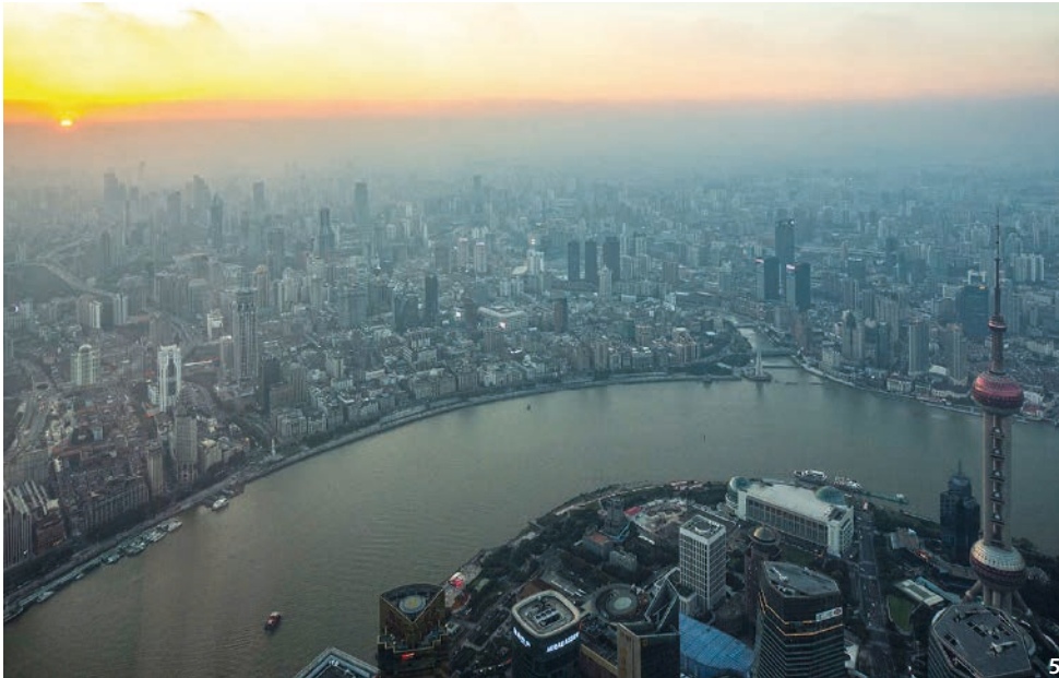
Figure 5 The vast urban landscape of Shanghai, a modern city par excellence and home to nearly 25 million people (Source: the author).

While the growth of Asian cities has been exceptional throughout the latter half of the 20 th century, this unprecedented growth might be outstripped by that of African cities in the 21 st century. According to research published in the Financial Times newspaper in 2018, the pace of expansion of African cities will exceed by some distance those in other continents over the next two decades (Pilling 2018). The 1.5 million population of the Ugandan capital, Kampala, is expected to grow by nearly 140% in the next decade and a half. Upon independence in 1962, it was home to just 60,000 people. In neighbouring Kenya, the population of the capital Nairobi has increased tenfold since independence in 1962 to exceed 3 million in 2018 (Figure 6). The capital of Burkina Faso, Ouagadougou, which in 2018 has a population of 2.2 million, is expected to rise by 115%, while Tanzania's coastal city of Dar es Salaam will grow by 120% from the current 4.4 million. Kinshasa, capital of the Democratic Republic of Congo, already has a resident population of over 10 million, making it the largest French-speaking city in the world. While Asia and Africa continue to transform our perceptions and experiences of the modern city, these 21 st -century metropolises feature comparatively little in scholarly research, reminding us of Graubard's cautionary comment about studies of the future needing to take into greater account subjects that have been and continue to be concealed from the West.