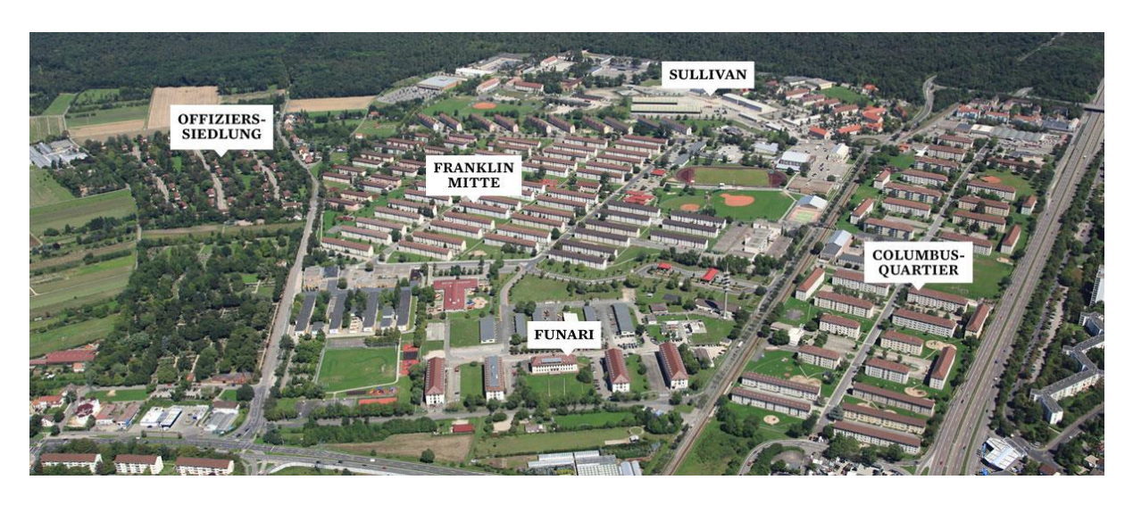
Figure 4 Subdivision of BFV.

The moment the US army leaves Mannheim constitutes a second layer. When the working of the military base is disrupted, suddenly it 'become[s] a great deal more visible, politically and culturally' (Graham in Farias 2010, 198; Leigh-Star 1999), opening an important entry point to excavate the politics of urban life (Graham 2010a, 3). What had previously been perceived by the local population as 'no man's land' (Niemansland Film 2017), now turned to the city's centre of attention. Indeed, a municipal development company was specifically created to plan the conversion and sell the new development to investors. For the Columbus Quarter in the Southern part of BFV, where refugees are sheltered, a large commercial site was planned, hoping to generate growth in competition with the neighbouring federal state Hesse (Interview 005).