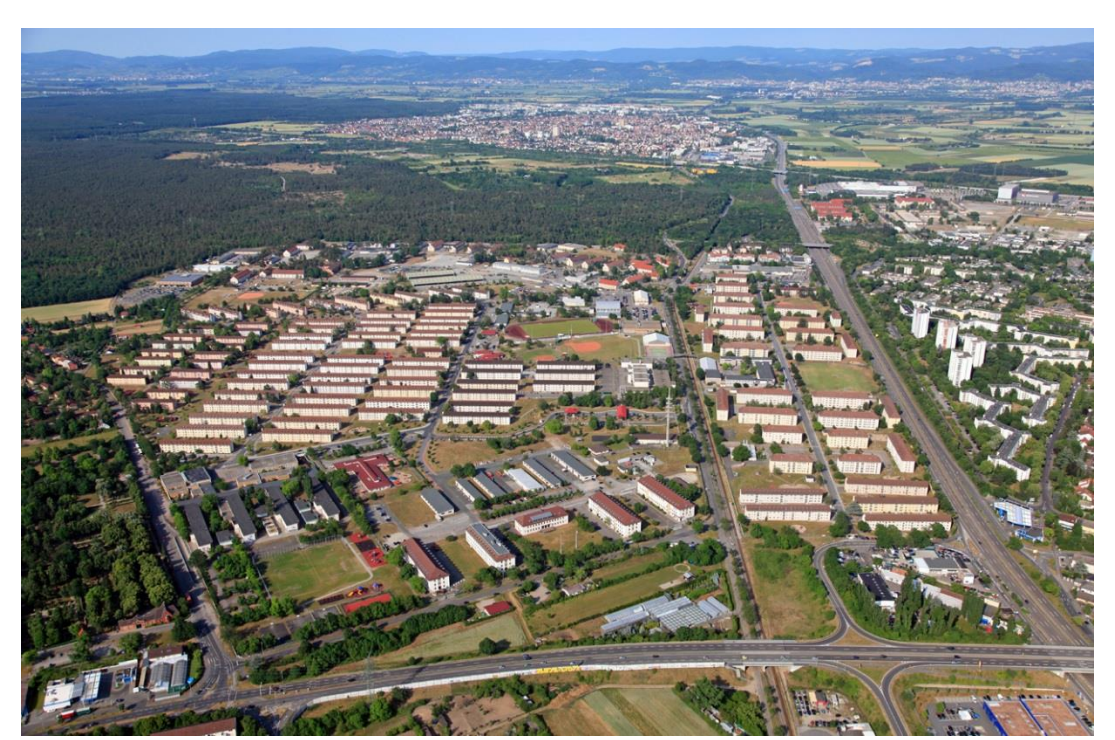
Figure 2 Areal View of Benjamin Franklin Village (BFV).

'Everyone know that that's not possible, that they [the refugees] are not allowed to do that...and everyone does it. And why should I prohibit taking the tram for one station? No, no...that doesn't make sense. Then that's how it is and they spend one day in the "wrong" federal state. So what?' (Interview 007)