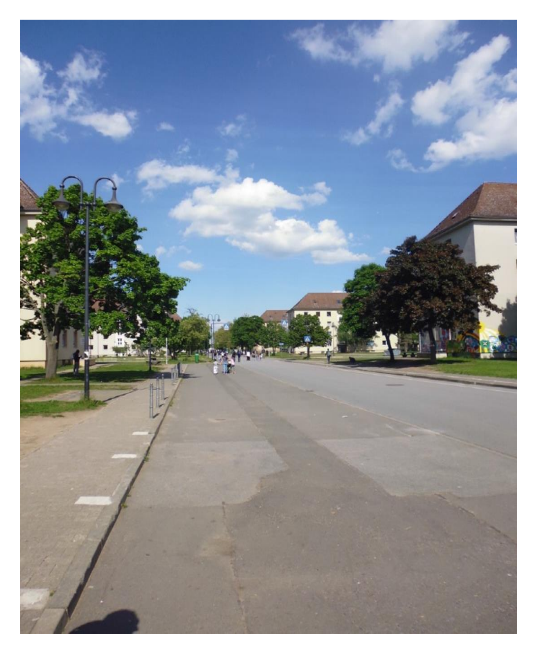
Figure 6: Main boulevard.

However, attending to the site ethnographically reveals that these technical aspects do not suffice to understand its socio-political components. Politics is neither prior to, nor determined by the material structures of space; rather it emerges through affective engagements with their materiality, becoming meaningful through the relationship it holds with specific social process (Knox 2017; Bevan 2006). Thus, focusing more closely to the resident's affective engagements with the material arrangements of the site generally