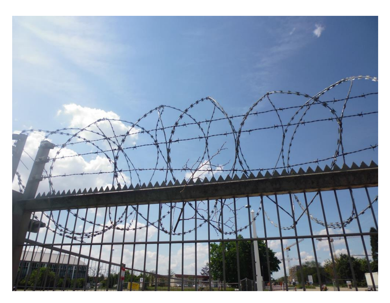
Figure 7: Barbed wire surrounding BFV.

The comment illustrates that BFV itself is embedded into a larger system, a network of reception centres that are connected with each other, facilitating the senseless movement of refugees through this system and in doing so disrupting any social relation that could be built by staying within a familiar environment. Further, it alludes to the arbitrary nature of the German two-tire dispersal system, creating a double-edged nature of migrant management, which objects any spatial logic by distinguishing between state and municipal responsibilities. Resultantly, a family is taken from the EAE in Mannheim, to a central distributing place of the state in Karlsruhe, only to be taken back to Mannheim, where it will be sheltered in municipal accommodation.