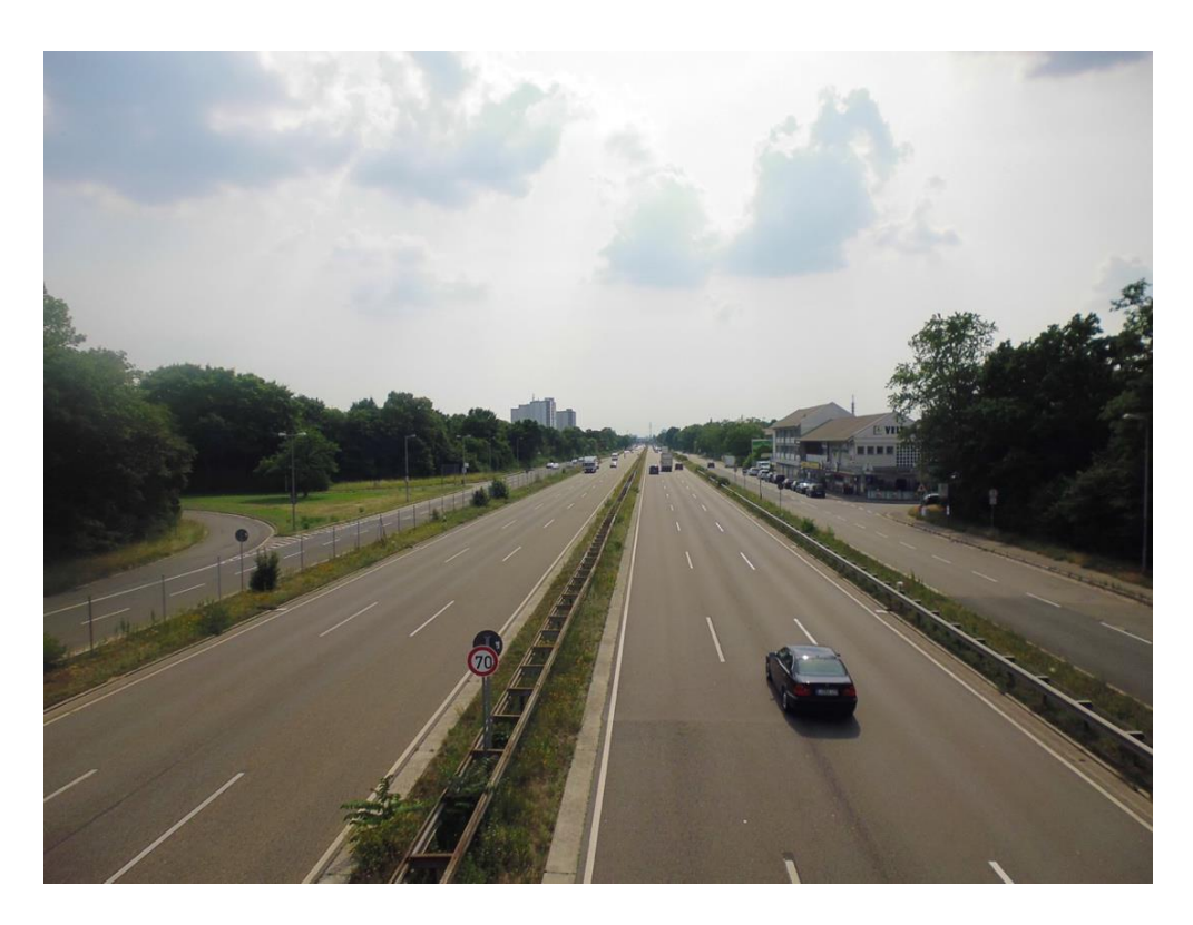
Figure 8: The highway B38. BFV is situated on the right.

BFV is not far from Mannheim's city centre. It is approximately 9 km to reach the city's central market place. It is not possible to compare its isolation to other centres in places that might by way further away from urban centres. However, it is striking that this spatial proximity is so contradictory to its residents' experience of the city, suggesting, perhaps, that we should see the reception centre as central, rather than peripheral, as this final comment by a social worker illustrates: