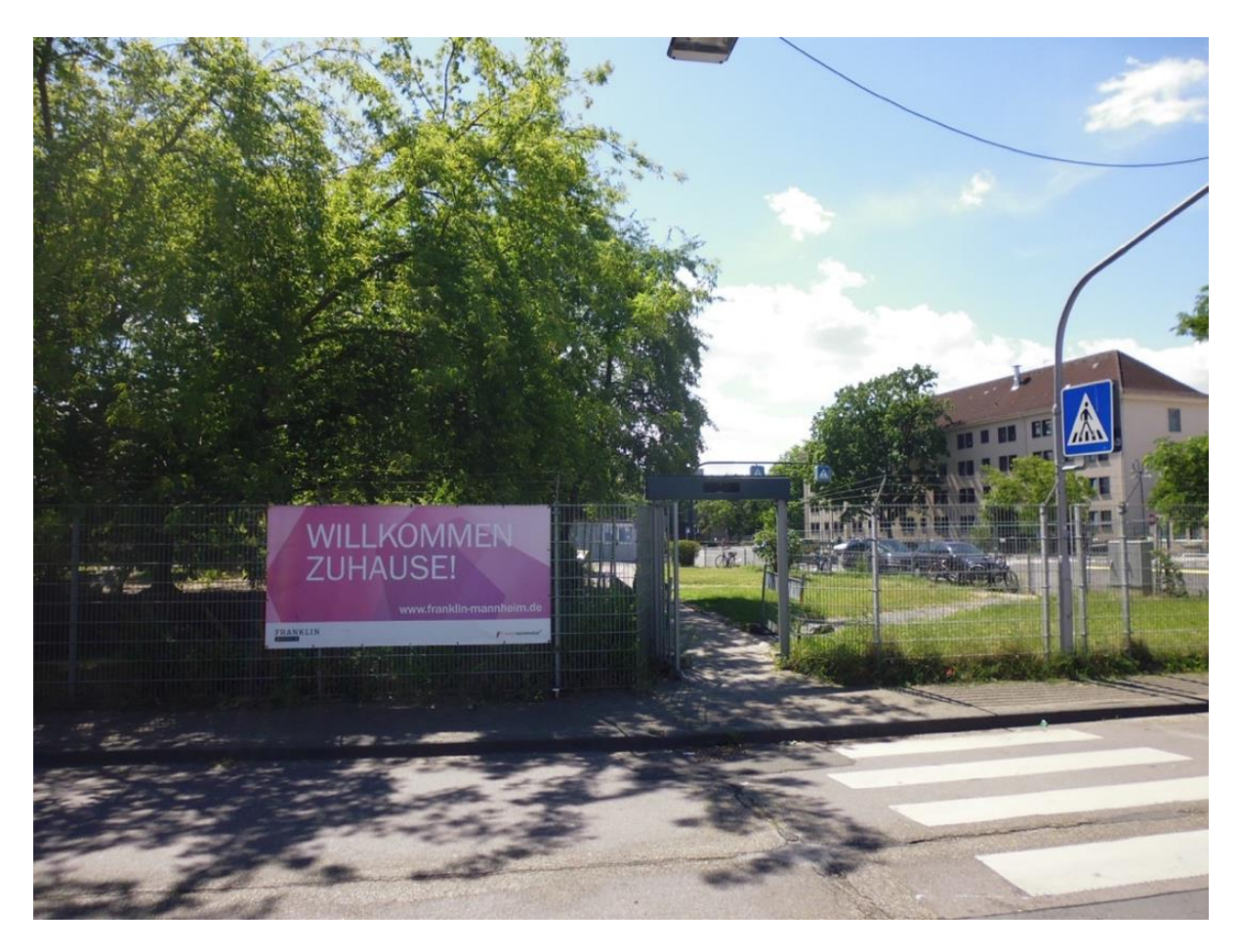
Figure 5: Advertisement at the entrance of the reception centre with the slogan 'Willkommen zuhause!' (welcome home. Curiously, it is owned by the municipal development company, aimed at potential invesorrs, not the current residents of BFV.