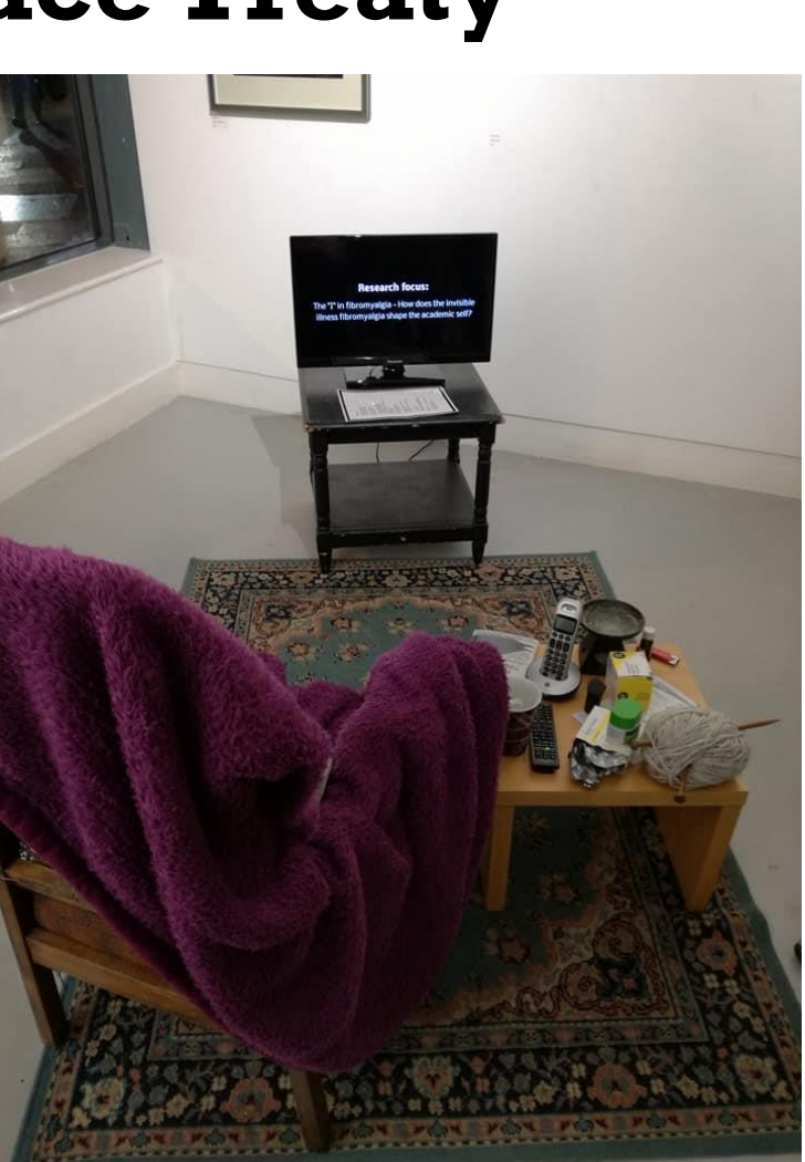
The Horsebridge Arts Centre, Whitstable, January 2018.

I have used materials and objects such as aluminium foil and a scarf to simulate stiff joints and reduced mobility in order to provide better insight in the ableist environment in shops or cafés.