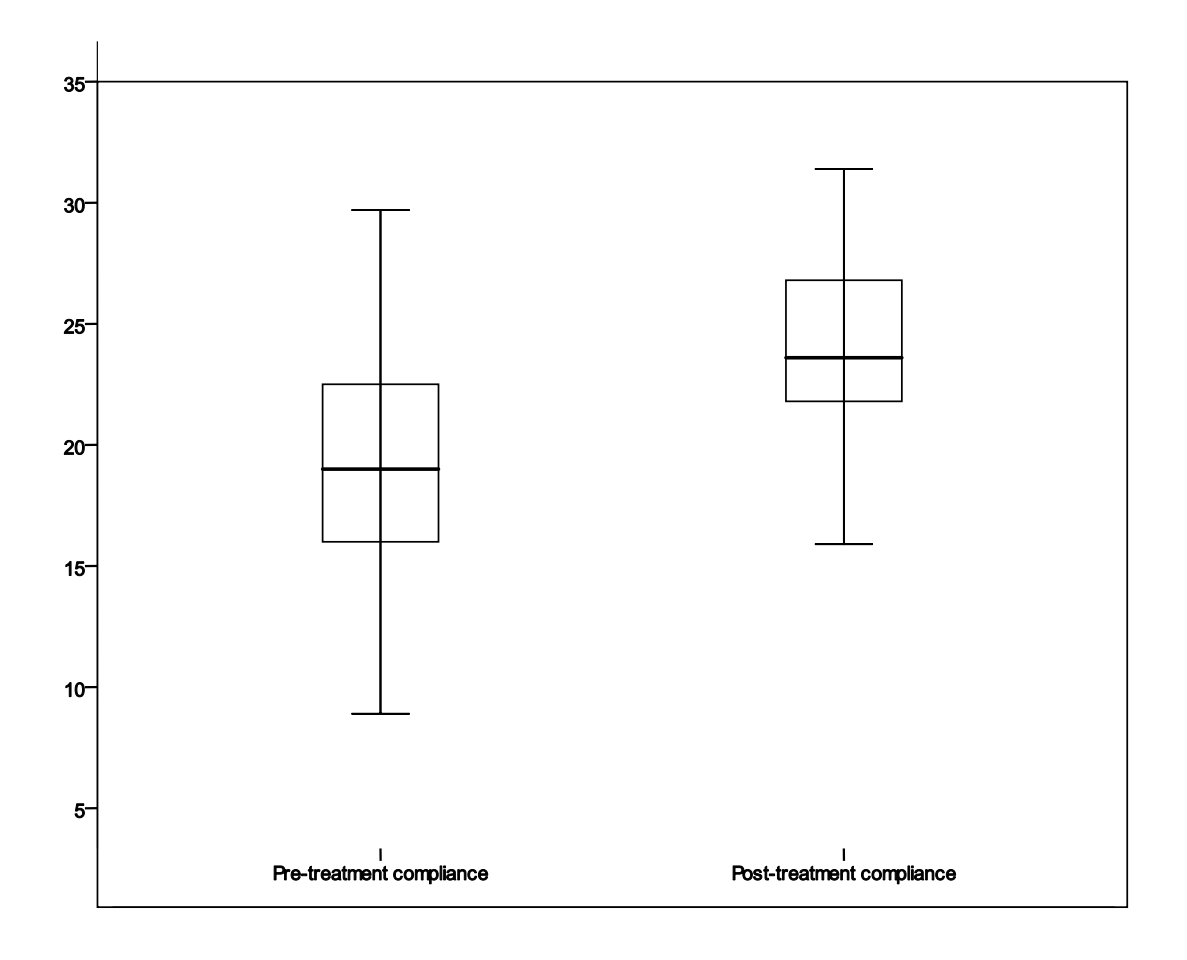
Figure 1: Box plots showing a significant increase in rectal compliance (ml/mmHg) before and after antimuscarinic therapy showing median and inter-quartile range.