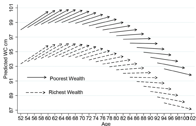
Figure 3 Vector graph showing adjusted 8-year ageing vectors of WC by wealth, ELSA 2004–2005 to 2012–2013. ELSA, English Longitudinal Study of Ageing; WC, waist circumference.

Using a large nationally representative sample of older adults in England, we found that age (linear and quadratic) was a strong predictor of both initial levels and changes over time in body size defined by BMI and WC. Our results showed that, in early old age, both BMI and WC increase significantly over the 8-year follow-up, whereas at older ages, both BMI and WC decrease steeply. When the age trajectories were explored by wealth, we found significant differences in initial levels of BMI and WC, with people in the poorest wealth quintile displaying significantly higher BMI and WC than those in the richest quintile. However, the rate of change in both BMI and WC did not differ significantly according to wealth, meaning that the age trajectories of BMI and WC were parallel across wealth categories and that the socioeconomic gap did not close at older ages. At any given age, individuals in the lowest wealth group presented a disadvantage compared with their richer counterparts.