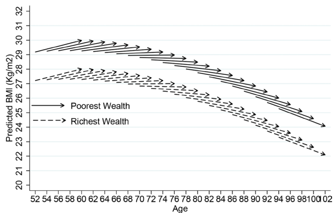
Figure 2 Vector graph showing adjusted 8-year ageing vectors of BMI by wealth, ELSA 2004–2005 to 2012–2013. BMI, body mass index; ELSA, English Longitudinal Study of Ageing.