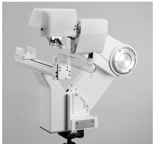
Fig. 1 iSR'obot MonaLisa (Biobot Surgical Ltd, Singapore)

Biobot (Biobot surgical, Singapore) is an ultrasound-based robot for transperineal prostate biopsy (Figs. 1, 2). It incorporates a pre-biopsy MRI with real-time transrectal ultrasound images to construct a 3D model of the prostate. All MRI targets and prostate boundaries and were defined with UroFusion (HT) (BioBot Surgical Ltd, Singapore). The iSR'obot™ Mona Lisa robotic transperineal biopsy device utilizes a software-controlled robotic arm which we mounted onto the operation table via a Micro-Touch™ stabilizer. The MonaLisa system was connected to a BK3000 ultrasound machine with a transrectal probe which mounted onto the robotic arm to provide a TRUS image of the prostate. Uploading of the previously generated UroFusion 3-D prostate model and suspected cancer lesions was then performed. UroBiopsy (BioBot Surgical Ltd, Singapore) is then used to generate the TRUS-based model which allows fusion of the mpMRI, and TRUS models. The robot has a gantry that utilizes a double dual-cone concept to ensure that the entire prostate can be sampled with two 1 mm perineal skin punctures and also defines the penetration depth automatically. All procedures were done under general anaesthetic, and at