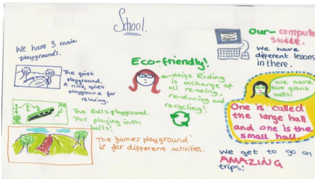
Illustration 2: I love my school

Leadership of Place also identified a cohort of ‘place leaders’ who sought to understand young peoples’ lives and experiences and connect to the wider archipelago of surrounding communities. The potential of school leaders to make a difference was inspiring. It sprang from a sense of hope, a sense of possibilities - a belief on their part that things could and should be different – and a recognition of the importance of place and belonging.