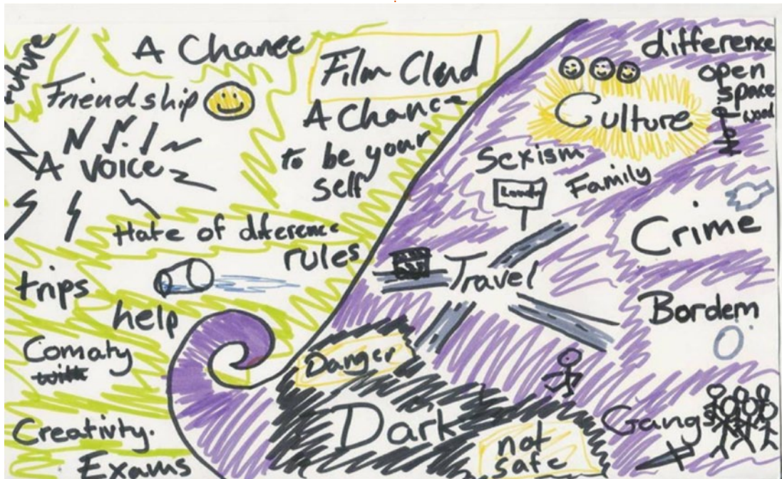
Illustration 1: My Life - Inside and outside School