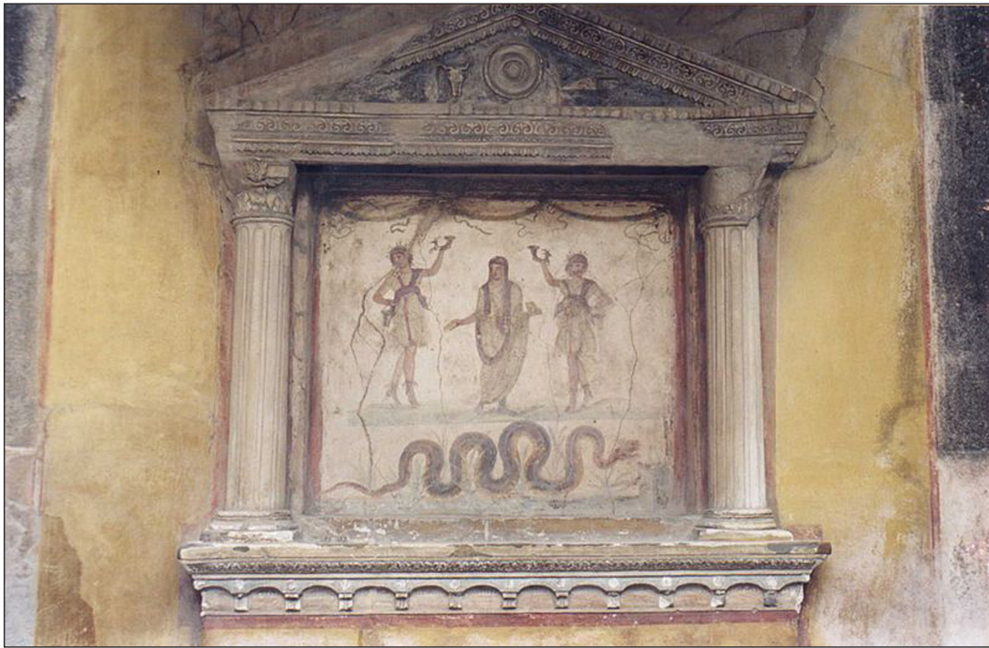
Figure 3: Depiction of the Genius Loci, Casa dei Vettii, Pompeii, 1st century AD. Image shows the Genius Loci, as the guardian spirit of the residence, standing between two household gods.

with inventive technologies to accommodate disruption. Discussing the reconstruction campaigns that followed the 2011 Japanese earthquake, Genadt shows how selected architectural proposals for the reconstruction of Tohoku were not mere responses to a state of emergency, but resonate with a history of resilient architecture that contextualizes them in the long term. His analysis highlights the balance that had to be met between government-driven ‘engineering resilience’, characterized by the implementation of durable, fail-safe solutions, and the local inhabitants’ desire to maintain a link to their past, which may be regarded as a form of ‘ecological resilience’. Highlighting the initiatives spearheaded by the ArchiAid and Home-for-All design groups in the reconstruction of Tohoku (2011–2016), Genadt relates how, in drawing upon the ‘genetic information’ of the region, architects realized resilient architecture that not only was physically strong, but also remained faithful to the long-standing spirit of the place.