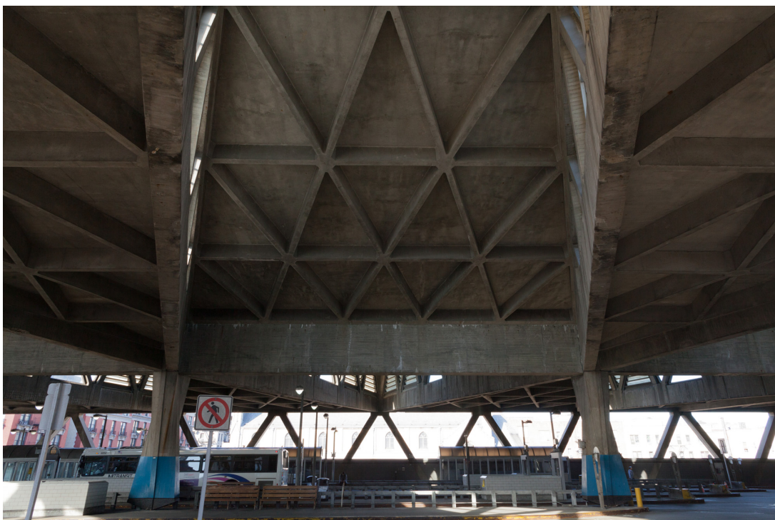
Figure 5: George Washington Bridge Bus Station, New York, designed by Pier Luigi Nervi (1961).

Roman classical architecture features again in the study of Marvin Trachtenberg, which interprets anew Louis Kahn's design for the New Yale Art Gallery (1951–53). Trachtenberg reads the project's huge, closed brick façade as a modernist interpretation of imperial architecture, harnessing, in spirit, the resilience of its formal characteristics and its symbolic associations. More provocatively, Trachtenberg argues that the ponderous Gallery façade was designed to appear physically defensive and resilient. As a visual 'Fire Wall' running along the edge of the Yale campus, Kahn's Gallery both guarded and separated the elite culture of the university from the city that surrounded it. In this case, the conceptual associations implicated in the idea of 'resilience' lead to a novel historiographical