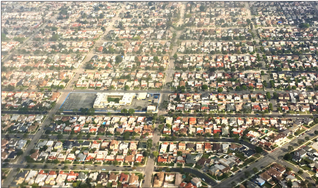
Figure 1: Aerial view of Inglewood, California. Photo by Leslie Evans, 2018.

protagonists to move beyond localized discussions of green technologies and sustainability. In this context, ‘resilience’ emerges as a pertinent concept that enables the transgression of limitations and blind spots of 20th-century modernist thinking and practice (Walker & Salt 2012).