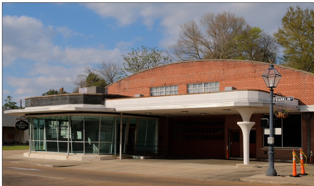
Figure 2: Former auto service station, repurposed as a community center, Natchez, Mississippi. In its physical form, the structure might be considered an example of American colonial architecture or resilient Palladianism. The building has also proven to be functionally resilient.

historically embedded in the modes of production and perpetuation of this historical knowledge? Do such long-standing ideas need to be decolonized and challenged, or should they be further developed to incorporate other possible forms of historical knowledge production? Selective genealogies proposed by architectural historians might deconstruct and critique their subjects, or alternatively, reconstruct and vindicate them. And since such conclusions are not mutually exclusive, history can be limited neither to the vantage of a single assessor, nor according to its own past trajectory. Through changing cultural attitudes and interpretations, the course of history unfolds as a responsive continuum, within which architecture and the built environment play major roles (cf. Giedion 1967: 5–6). As elucidated by the articles of this Special Collection, the concept of ‘resilience’ in architectural history provides a lens through which to look back, to examine constructs that previously were largely ignored, such as the Roman thermal baths or the constructions of Bernhard Klemm in the German Democratic Republic. At the same time, it offers a framework with which to reconsider oft-studied figures, concepts and structures – Pier Luigi Nervi, Louis Kahn and museum architecture, among others.