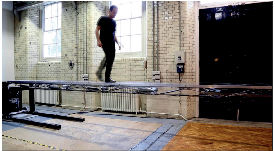
Figure 3. Expedition's adaptive truss was developed with UCL and ICE support

The thread linking virtually all of my work has been trying to understand the appropriate use of digital technology