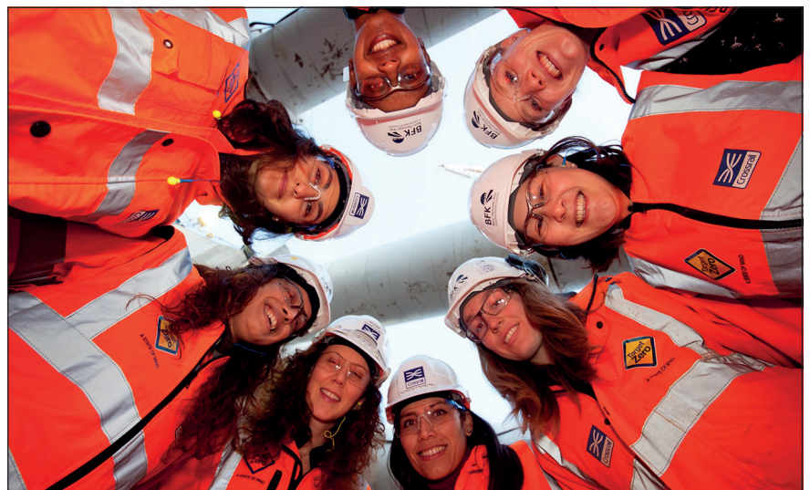
Figure 5. Female student and graduate applications to ICE are up to 21%

The profession also needs to change the perception of who a civil engineer is. Women represent 12% of ICE's total membership. Female applications are rising slowly, with 21% of UK students and new graduates being women (Figure 5). This year, 13 members and fellows of ICE featured in The Daily Telegraph (2016) top 50 women in engineering poll.