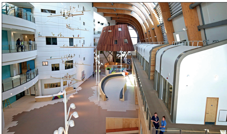
Figure 2. BIM enabled rapid delivery of Alder Hey Children's Hospital in Liverpool

While civil engineers need to borrow innovations from other sectors, they