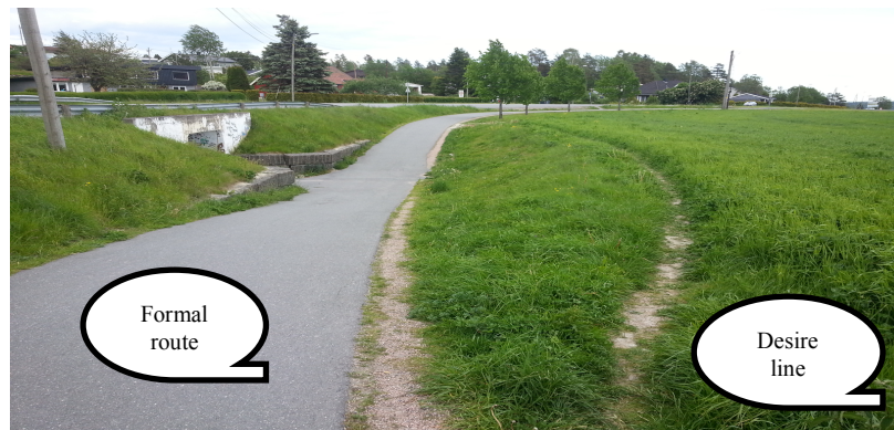
Figure 1: Desire line (adapted from https://i.imgur.com/HPIEMs7.jpg )

Despite being a relatively well-understood physical phenomenon in the related fields of physical geography and urban planning, desire lines - also known as desire paths, cow paths, pirate paths, social paths, game trails, social trails, Chemins de l'âne (donkey paths), kemonomichi (beast trails), and Olifantenpad (elephant trails) - lack a robust, inclusive definition. Even the origin of the term itself is debatable. The French philosopher Gaston Bachelard is often cited as the originator of the term 'desire lines', in his 1959 work 'The Poetics of Space' (Bachelard, 1959). However, the work itself makes no explicit mention of desire lines or desire paths.