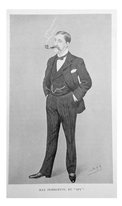
Fig. 2: Max Pemberton, by the famous cartoonist "Spy" (Sir Lesley Ward) from Vanity Fair , reproduced in Max Pemberton, Sixty Years Ago and After (London: Hutchinson & Co., 1936), after p. 152.