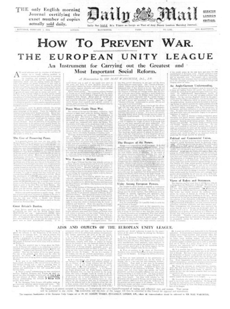
Fig. 9.: Full page advert on the cover page of the Daily Mail with the European Unity League's founding manifesto, 7 Feb. 1914.