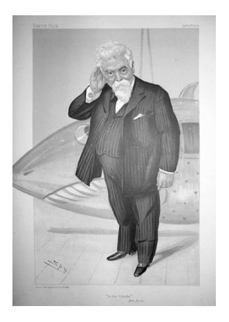
Fig. 7: Hiram Maxim, inventor of the machine gun and model for 'Faber', by "Spy", Vanity Fair, 15 December 1904.

And the part of "writer of eminence to talk it [the European Unity League 's campaign] up", that according to the novel's account was lacking so far, 86 was of course the role Pemberton had carved out for himself.