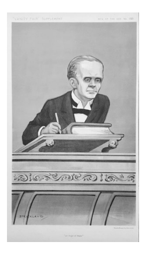
Fig. 3: Norman Angell, 'an Angel of Peace' (Man of the Day, no. 1321) by Strickland, Vanity Fair Supplement , 6 March 1912.

emanated from Quaker Circles.<sup>30</sup> 'New Pacifism' on the other hand claimed to be based on rational, economic arguments and could trace its intellectual origins back to Richard Cobden's and John Bright's mid-nineteenth-century campaign for the removal of trade barriers between the nations as the most effective mechanism for preventing war. It had considerable appeal in liberal circles and often combined the propagation of Free Trade with ideas of international organisation.<sup>31</sup>