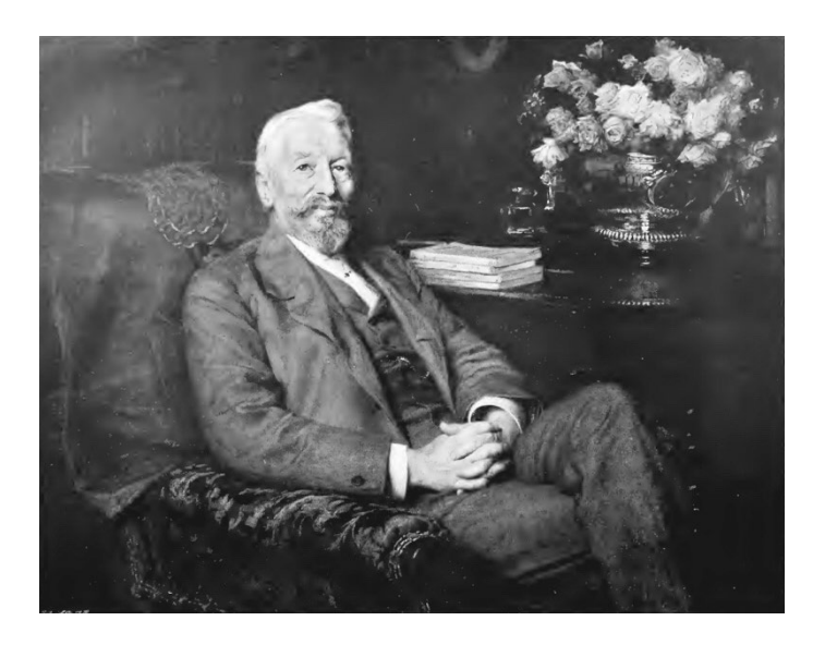
Fig. 5: 'Max Waechter, Esq., D. L., J. P., High Sherriff of Surrey', painting by Sir Lawrence Alma-Tadema, R. A., in: Royal Academy Pictures 1902: Illustrating the Hundred and Thirty-Forth Exhibition of the Royal Academy (London, Paris, New York and Melbourne: Cassell and Company Ltd., 1902).

His scheme, which differed from Angell's approach in making an economic case not for mutual disarmament but for a Federation of the states of Europe (as a consequence of which arms reduction would follow automatically), was largely based on the proposal of pooling in one hand, for example that of a permanent conference of the great powers, defence and foreign policy plus introducing a single tariff and free trade across the continent. Apart from in Cobdenism its intellectual roots can be found in the late-nineteenth-century discourse in Liberal circles about federalism and customs union as a means to secure the permanent unity of the Empire, put forward by late-Victorian and Edwardian organisations like the Imperial Federation League , the British Empire League and the Tariff Reform League , from where models for federation and customs union were transferred to the even more pressing question of securing peace in Europe. Together with federal solutions for the Irish question ('home rule'), Michael Burgess has