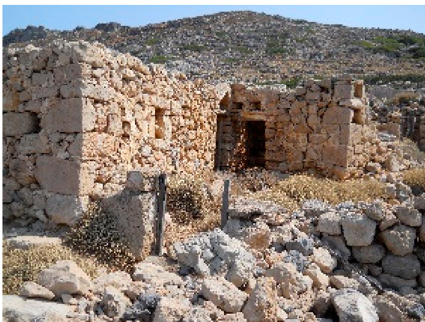
Figure 2. Remains of the nineteenth century houses surviving inside the archaeological site of the 'Castle' (04/08/2010).

According to personal communications with local people, before the designation of the Castle area as an archaeological site (and therefore as a protected area) by the Greek state, the hill was inhabited until the 1980s by members of a local family (the Ploumidis family). The family also owned the land plot, which currently contains the remains of the sanctuary of Apollo. The remains of the family's houses date to the 19th century [34] and are still visible on the site (Figure 2).