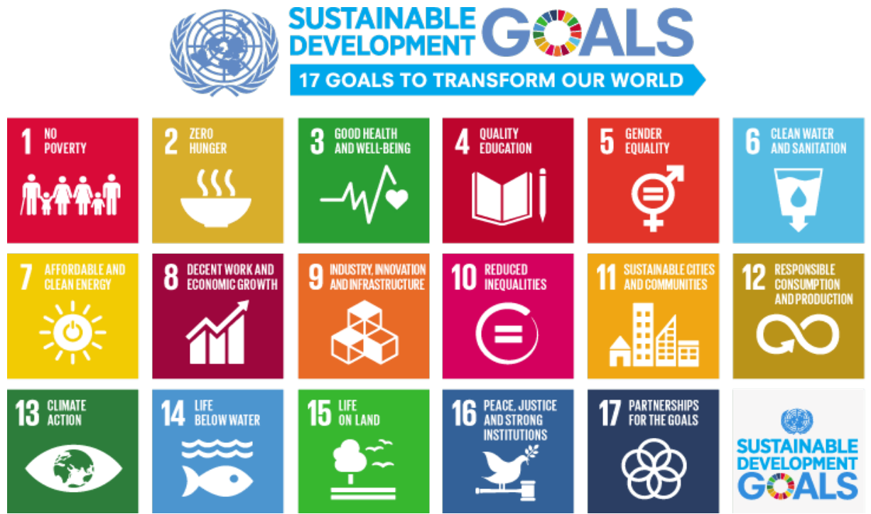
Figure 2: Sustainable Development Goals.

EWB-UK has embraced the UN's Sustainable Development Goals as core principles guiding its efforts (see Figure 2) and the team will also consider which of the SDGs figure prominently in interview narratives.