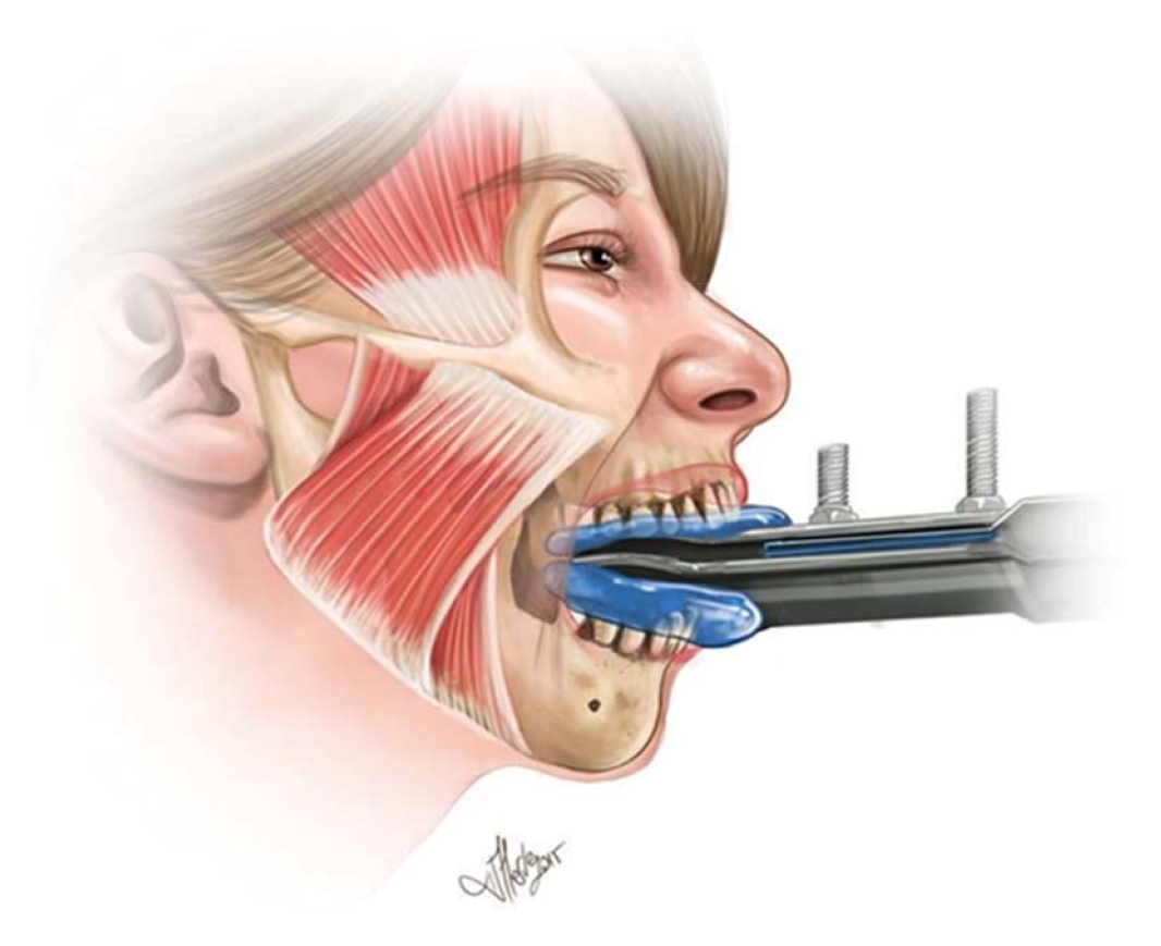
Figure 1. The illustration depicts the biting platform and the position of the subject. The mold illustrated as blue, allowed all teeth to be involved. A force transducer was placed close to the base of the tungsten plates which corresponds to the right most of the illustration.

to chiropractic care due to the limited number of chiropractors practicing in Turkey. Bite force was assessed pre- and post the intervention and at 1-week follow up. After their last assessment session, the participants were informed whether they received the sham or chiropractic care. Elven out of 14 in the sham group believed they received the chiropractic care.