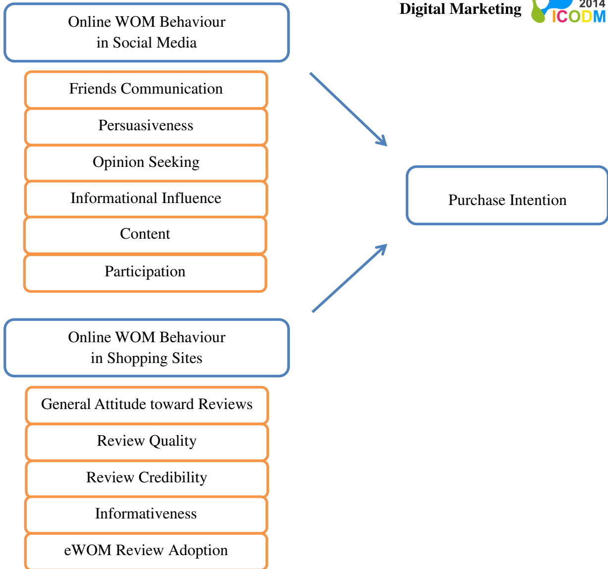
Figure 2. Model of Study 1

In the second phase, interviews will be conducted to expand initial results and to find how/why social networks and eWOM message types differ from each other in terms of affecting purchase intention. By using interviews, we aim to understand these questions deeply. The use of interviews can help the researchers to get reasonable and credible data which are appropriate to their research questions (Saunders, Lewis and Thornhill, 2012).