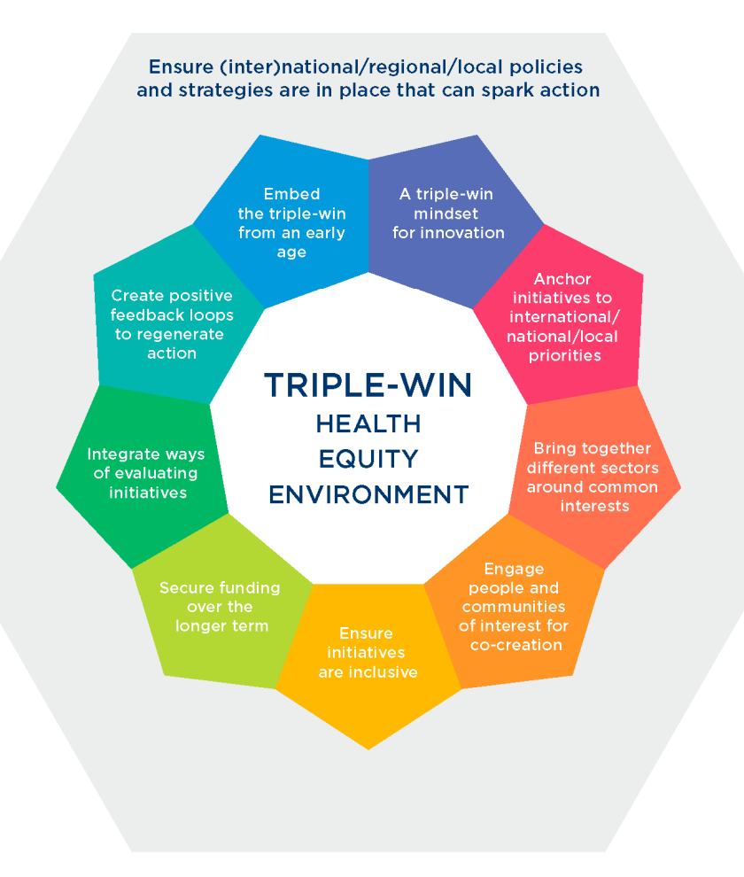
Figure 2. Overarching lessons for good practice for the INHERIT triple win.