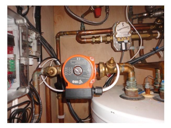
Fig. 1. CS12 – Uninsulated pipework associated with heat pump.

CS12 was another poorly performing case with SPF initially estimated as 0.7. The heating system was characterised by un-insulated pipework (see Fig. 1 below).