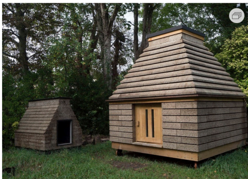
Cork Cabin around 6 months after completion with Cork Casket, completed 3 years earlier, standing next to it, 2017. < 1 of 2 >

Stage two was the development of the Cork Construction Kit, beginning in 2015. This was in-depth research, part funded by Innovate UK and EPSRC under the 2015 Whole Life Building Performance competition. It was undertaken by a multi-disciplinary team from industry and academia: MPH Architects , The Bartlett School of Architecture UCL , Arup , University of Bath , Amorim and Ty Mawr . The key aim was to research and develop a radically simple solid cork and timber construction kit. The design hypothesis for the system considered the relationship between material, components and resultant architectural forms. Technical performance was developed using cycles of 'hypothesis, test, evaluate, rethink' to address matters including structure, fire safety and weathertightness.