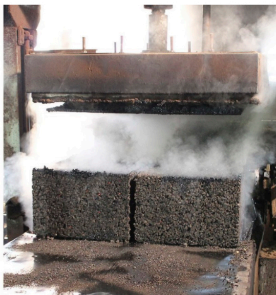
A freshly cooked expanded cork block emerging from the autoclave at Amorim Islamentos, Vendas Novas, Portugal.

The aim of this research was to develop a radically simple new form of plant-based construction, composed of engineered timber and pure expanded cork, made of waste from Mediterranean cork oak forestry. Using these materials locks in atmospheric carbon for the life of the building component and also helps to secure the biodiverse landscapes from which the cork is harvested.