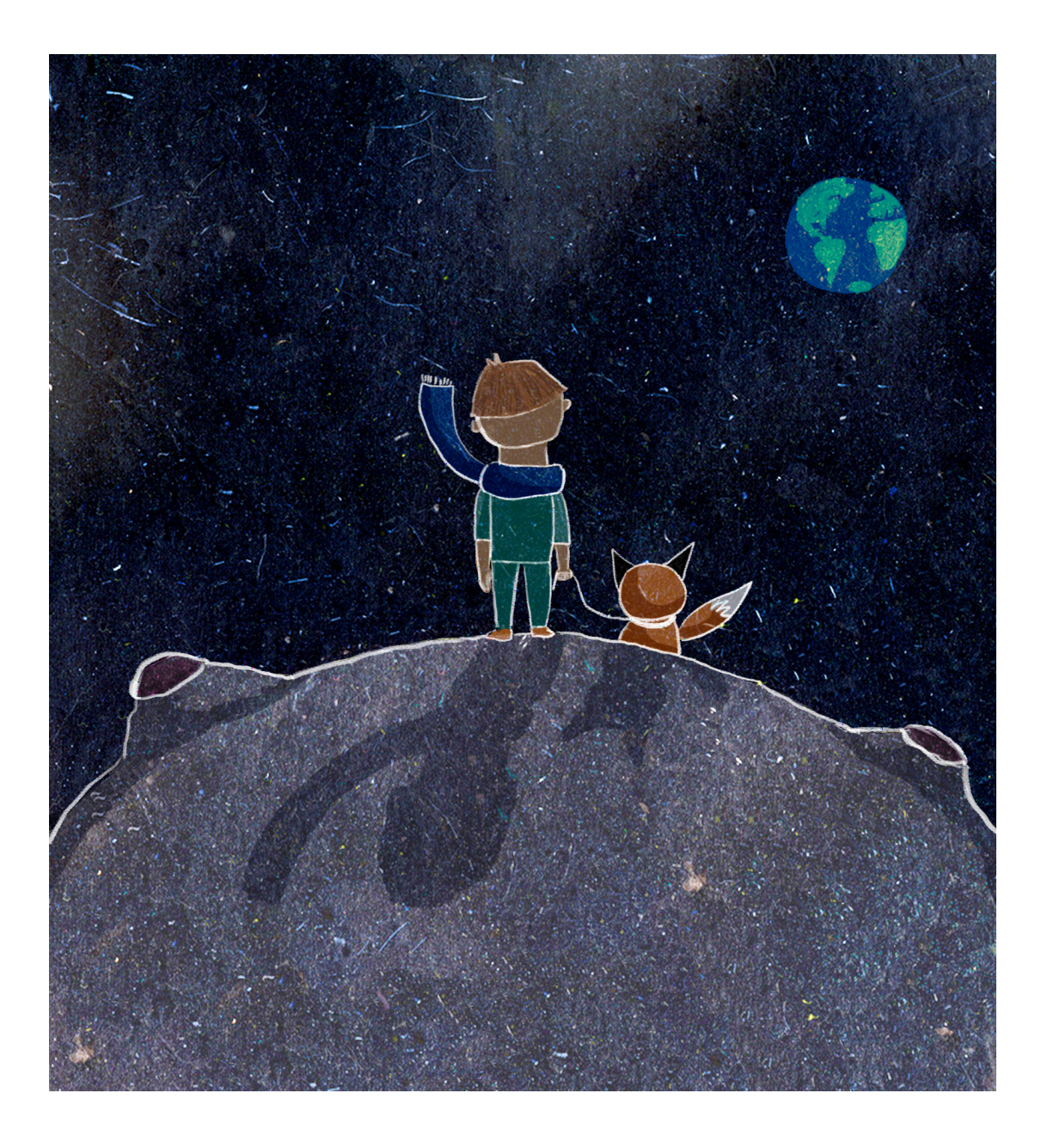
Bellaterra Journal of Teaching & Learning Language & Literature