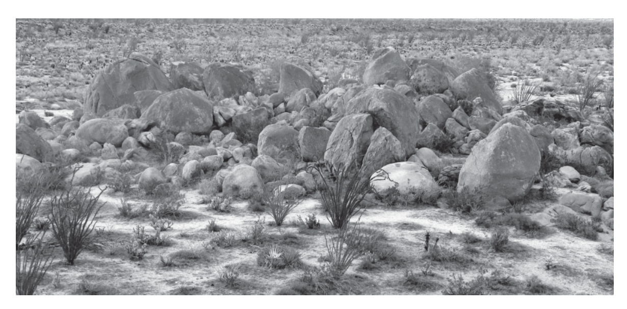
Figure 2. The Mine Wash site (CA-SDI-813).

correlating well with historic accounts of ancient trail systems (Quinn and Burton 2009:282). For example, compositional analysis of 115 sherds from the Anza-Borrego desert site of Mine Wash, or CA-SDI-813 (Figure 2), which has a <sup>14</sup>C date of AD 1590–1640 for the ceramic stratum (Sampson 1984), and comparison with a growing database of ceramics and raw materials from San Diego County highlight two main patterns in the movement of pottery and people to and from the site (Quinn et al. 2011). The majority of the sherds analyzed are composed of fine sedimentary clays that were tempered with particulate matter such as sand and grog (Figure 3A-C). These ceramics are likely to have originated in the desert lowlands to the east. A second group of pottery fabrics at Mine Wash is characterized by residual clay from the weathering of various types of plutonic igneous rock including granite, tonalite, and diorite (Figure 3D-F). Ceramics of these fabrics are common at sites in the mountains to the west and match clay deposits that form in this wetter environment. Three specific residual igneous compositions that occur at previously studied Laguna Mountain sites (Quinn et al. 2011) are present in small but significant numbers