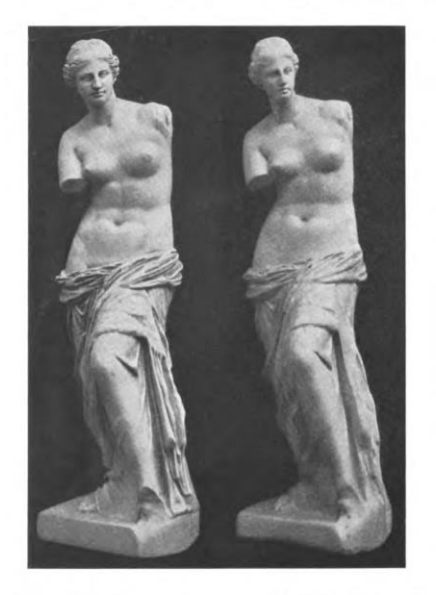
CASTS AND CASTS A Few Pictured Comparisons between CAPRONI CASTS and those of Other Makers

A Caproni Cast Note the clear, sharp modeling of this statue, which is an exact reproduction of the priceless marble statue of the Venus of Melos in the Museum of the Louvre, Paris.