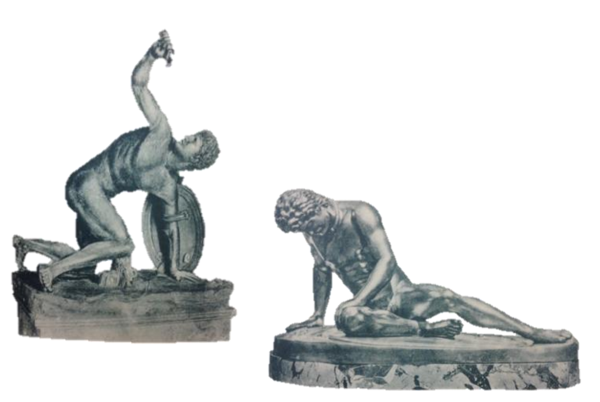
Figure 7 . Drawing of a cast of the Fallen Warrior.<sup>111</sup>

Gaul was probably discovered shortly before 1623 from the Gardens of Sallust during the building of the Villa Ludovisi, and also entered the Capitoline collections.<sup>110</sup>