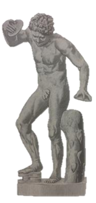
Figure 6. Drawing of a cast of the Dancing Faun.<sup>90</sup>

drawings, and engravings of the statue. These influenced the way that other restorers approached their own sculptures, which they wanted to reflect this famous example.<sup>89</sup>