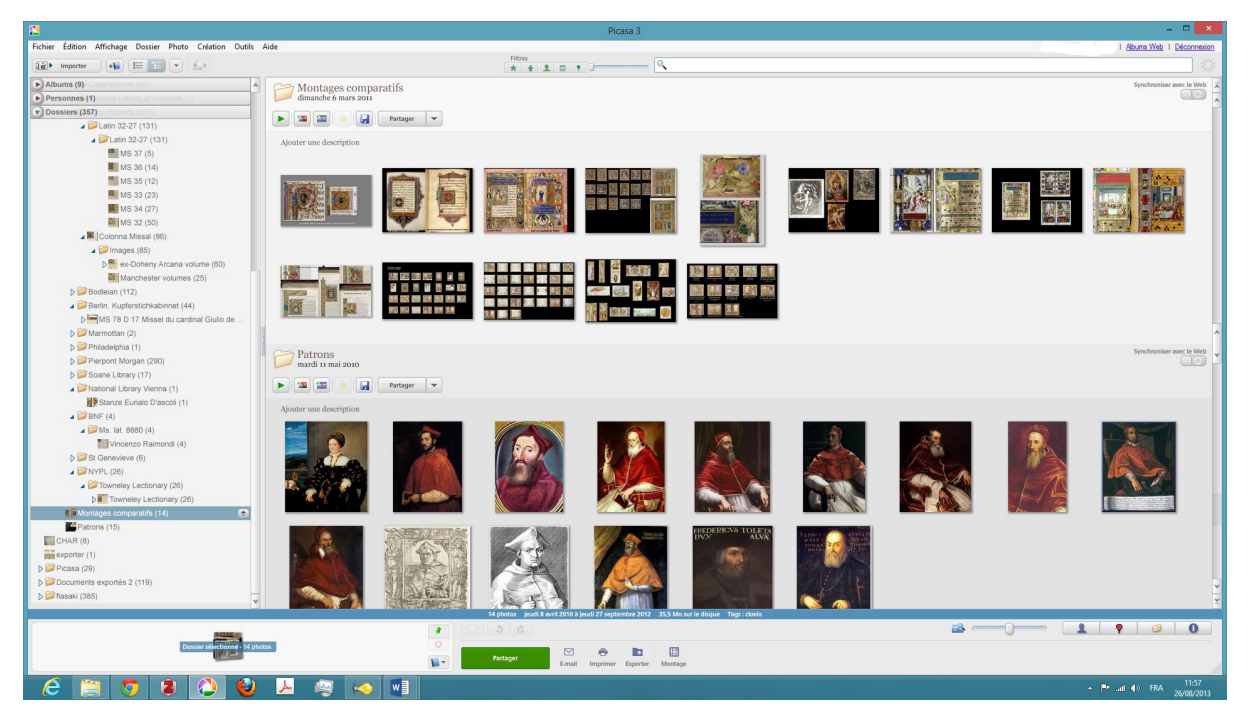
Figure 5. Part of Participant 09's digital information collection, which includes images of manuscripts

Although participants in this study did not raise the issue of color accuracy, it can be argued that, for the majority, this was one of the main concerns when looking for and using digital resources containing visual material. More specifically, high resolution and color accuracy are necessary features of the digital images used in the study of art and historical artefacts;<sup>28</sup> according to Rhyne "as evidence, images are valued to the extent that they approximate what one would see if looking at the object itself."<sup>29</sup> Digital images with these characteristics are essential tools for conducting traditional<sup>30</sup> and digital research<sup>31</sup> as well as for teaching and publishing in art history.<sup>32</sup>