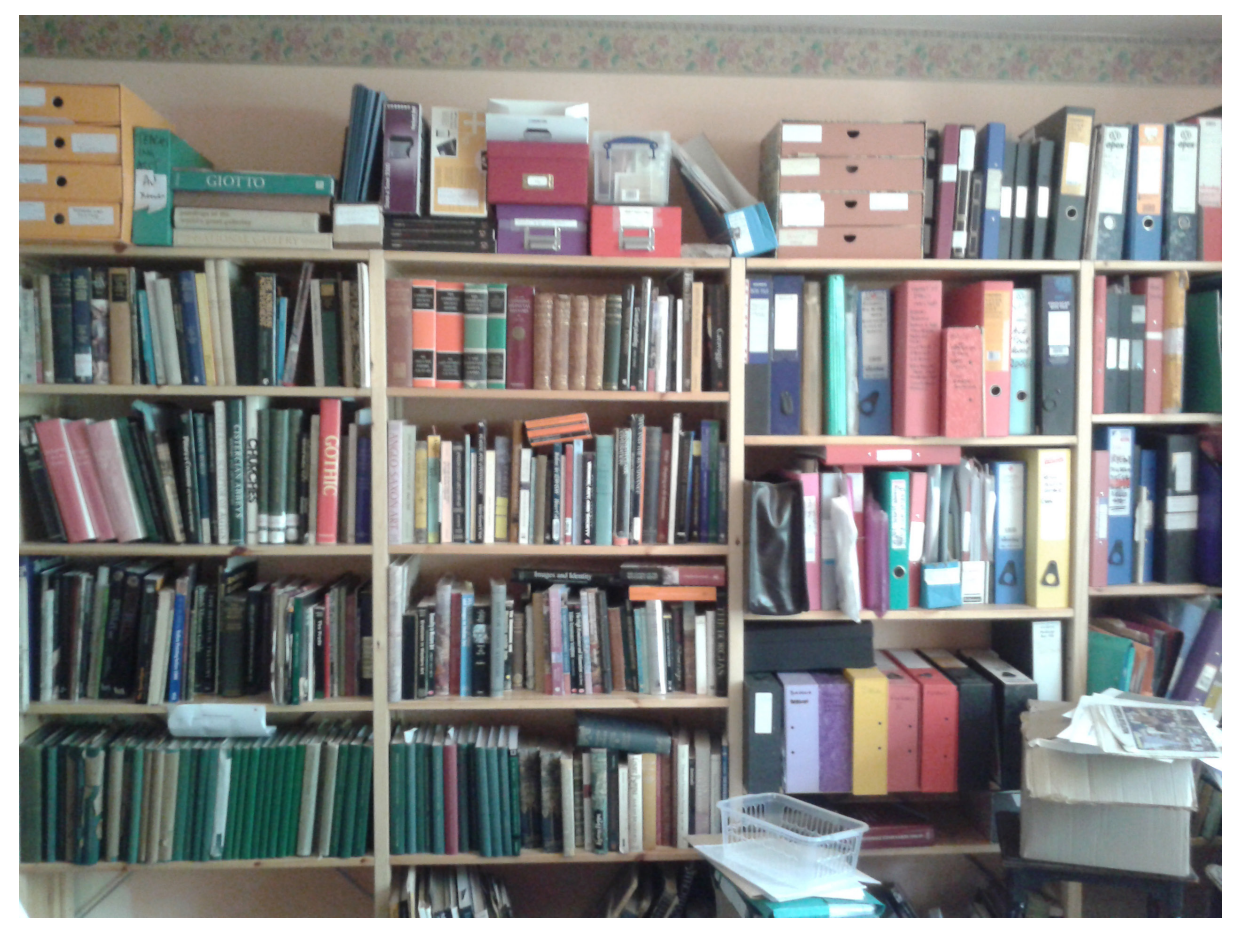
Figure 1. Part of Participant 03's personal physical information collection