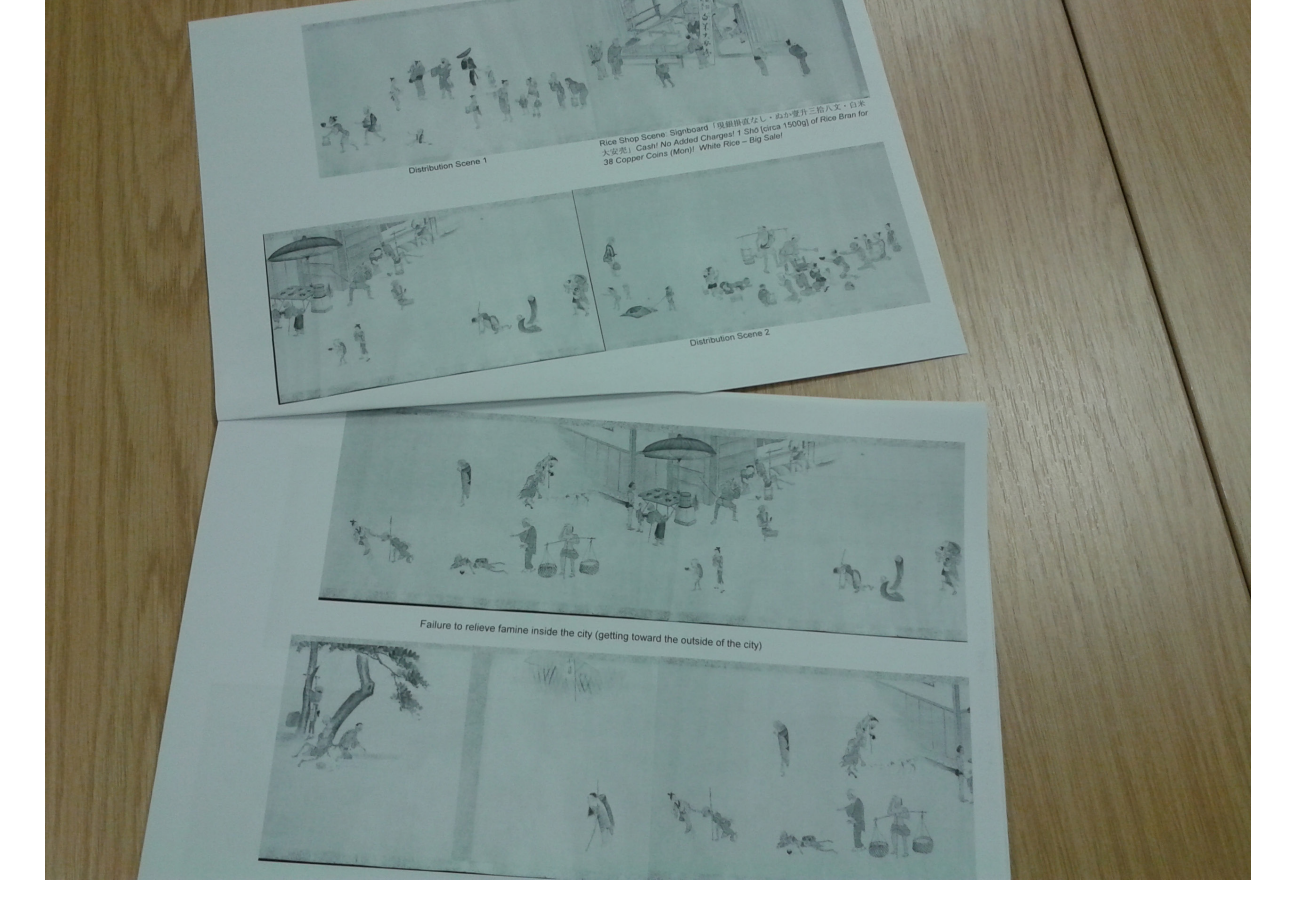
Figure 4. Photograph showing print-outs of a Japanese scroll used by Participant 08

digital resources, but also contributed to theory through extending and varying the ISP model. Further exploration of the reasons behind the different behavior that scholars have at the different stages of research (e.g. problematic access or the need for more 'focused' information and, accordingly, the types of material needed) can lead to more targeted digitization of material that is currently unavailable as well as to the creation of digital infrastructure that facilitates the discovery of this information, including potentially enhancing serendipity, through advanced searching facilities and useful metadata.