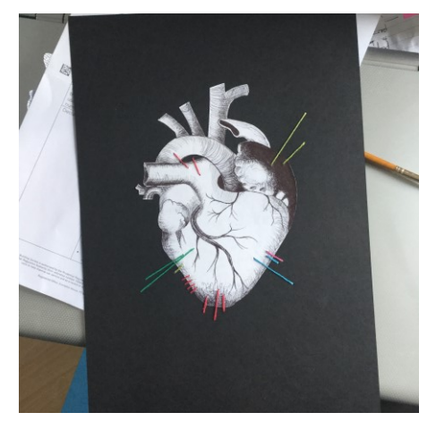
Figure 2: Visualization brought to workshop by P1, Strings represent category (colour) and intensity (length) of worries.

Quote 1: "I'm using my phone just what I'm using it for, so having the ability to track it, to me, it's fairly redundant. Because you know, I can see and I know I spend most of my time on a certain app. That's what I want to do." (P12 talking about RescueTime: an app usage tracking tool)