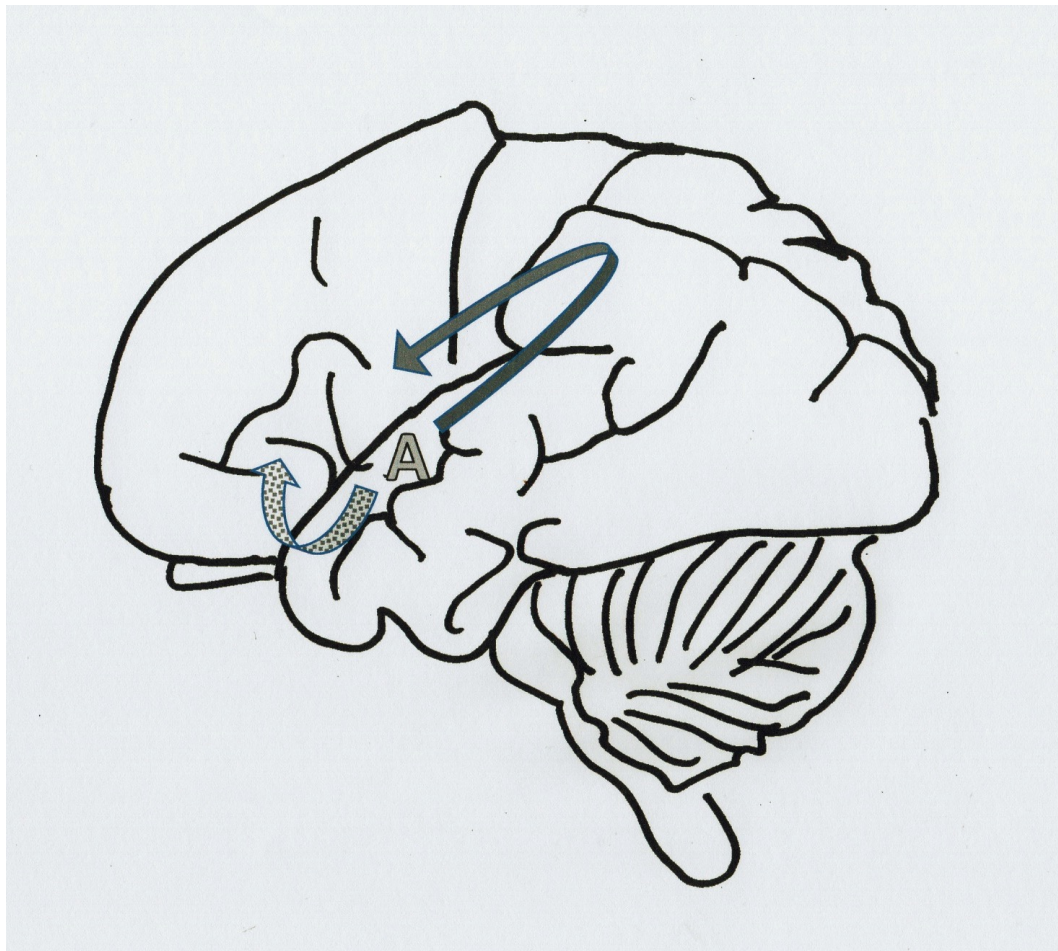
Figure 1. Schematic of left hemisphere lateral surface showing perisylvian regions centred on ‘A’, (secondary) auditory cortex in the superior temporal lobe (STC – see text). The dark arrow indicates the dorsal projection stream and the stippled arrow the approximate route of the ventral projection – both to inferior frontal regions.

It might be assumed that deaf children, denied access to heard language, must become efficient speechreaders. However, younger deaf children can be worse speechreaders than hearing children (Kyle et al., 2013), although deaf adults often outperform hearing people on tests of speechreading (Mohammed et al., 2006). It is likely that skilled speechreading in deaf adults makes use of multiple strategies to infer the meaning of the speechread message (Feld and Sommers, 2009), and see section on working memory, below). Skilled speechreading is effortful, and it can make greater demands on general cognitive processes than hearing speech (e.g. Hornsby, 2013). The hearing speechreader has less need to develop these skills, which could explain the difference in performance in the adult populations.