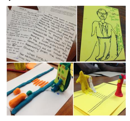
Figure 3: Stories and technology solutions developed by participants during the co-design workshop. From top left clockwise: Stories from the future, GPS-enabled talking white cane and two Barra Barras (Zebra crossings).

The society described provided VIPs with the support they needed to thrive, and the children of the future became world-renowned doctors, computer engineers and pilots because they had both advanced technology and supportive social systems. The mobile phone was not explicitly mentioned as part of this future. Instead participants designed an array of connected technologies (see Figure 3). Interestingly, nearly all of these technologies exist, and nearly all solutions focused on navigation. Independent navigation is key to developing social interactions within people's lived environments [46]. The importance of navigation was clearly evident in study 2, which makes its complete omission in study 1 all the more poignant (it was identified by its omission as a restricted interactions).