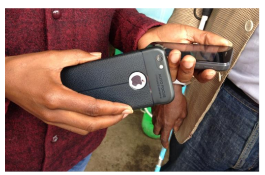
Figure 4: An example dependent interaction – an M-Pesa agent helps a participant perform financial transactions by entering relevant data on the phone.

All participants had built relationships with one specific M-Pesa agent that they would go to in order to complete essential mobile banking transactions. The agents of these trusted shops are relied upon. Often the VIP would assess how they were treated, then build up trust by becoming a committed and loyal a customer. VIPs had honed their abilities to assess which people were trustworthy through trial and error. This trust was built up "little by little until the time that my instinct tells me that you are a good person" [P06, Interview]. Most participants were very cautious about deciding which shopkeeper they would trust, and this was often motivated by the fact that they had been defrauded or they have had items stolen from them before.