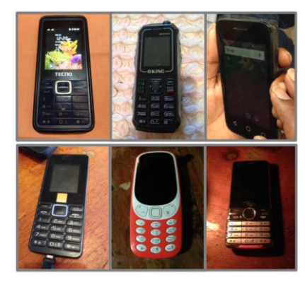
Figure 1: Mobile phones used by interviewed participants

During ethnographic observations, participants demonstrated how they used their mobile phone inside and outside of their home for everyday purposes related to their personal and working lives. Attention was also paid to the use of other technologies and any interaction that occurred with relevant members of the human infrastructure of the participants. Short unstructured interviews were carried out with these technology supporters to further explore the different interactions. Informed consent for these unstructured interviews was gathered verbally before data was recorded.